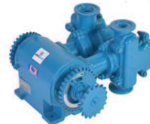
NGP-5655-ARF APPLY TWO PRODUCTS AT TWO RATES