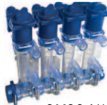
SMSS4 W/ SMPT-OSA4