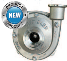
CS-155RGS STAINLESS STEEL

Efficient and versatile pumps for Hydraulic, Gas Engine, and Shaft Drives