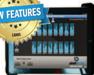
WIRELESS OR WIRED

Proper application equals increased yields. Know your flow!