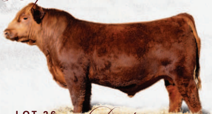
LOT 26 GILMAN'S Durham 88N