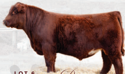
LOT 6 GILMAN'S Boque 63N