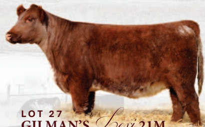
LOT 27 GILMAN'S Levi 21M