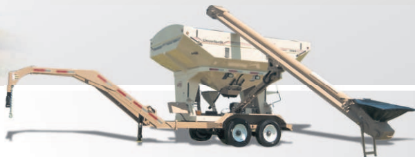
SEED RUNNER® BULK TANK TENDER

Deliver your high-value seed investment quickly and safely during the narrow planting window with a patented Seed Runner® or Seed Pro® seed tender!