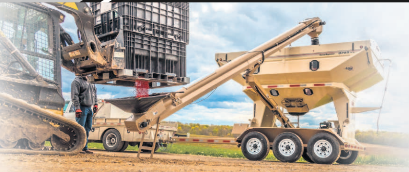
SEED PRO® BULK BOX CARRIER