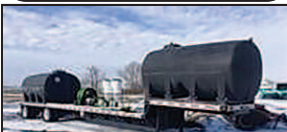
2001 48' TRANSCRAFT CALL FOR PRICE DROPDECK TRAILER, alum combo, air ride, spread axle, w/ NEW 2--3200 gal center sump water/fert tanks, 2--30 gal chemical mix cones, 3" 13 hp Honda pump, electric hose reel, all hose and valves, FIELD READY