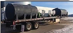
1998 WABASH 48' CALL FOR PRICE FLATBED TRAILER, w/ NEW 2--3200 gal water/fertilizer tanks, 3 mix cones, 13 hp Honda pump, electric hose reel, FIELD READY