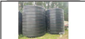
10,000 GAL $13,500 ENDURAPLAS WATER / FERTILIZER TANKS 3" bulkhead, sight gauge