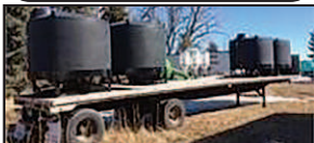
1996 FRUEHAUF 48' CALL FOR PRICE FLATBED TRAILER, air ride, spread axle, alum combo, w/ NEW 4--1600 gal cone bottom water/fertilizer tanks, 13 hp Honda 3" pump, 3 mixing cones, 3" electric hose reel, FIELD READY