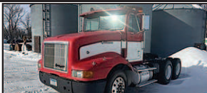
1994 IH 9200 DAY CAB SEMI TRACTOR, $19,500 Cat engine, 9 spd transmission, wet kit, air slide plate, 848,000 mi