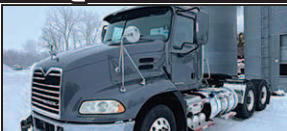
2017 MACK PINNACLE CXU613, $59,500 MP8 engine, M drive, auto transmission, engine brake, PTO, twin screw, air ride