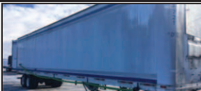
2005 GREAT DANE CALL FOR PRICE 48' REEFER TRAILER, 3 side doors, swing rear doors, w NEW 4-- 1600 gal Cone bottom water/fertilizer tanks, Honda pump, mixing cone, FIELD READY