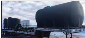
1999 WILSON CALL FOR PRICE DROPDECK, aluminum combo, air ride, w/ NEW 3200 gal horizontal tank, 2--1600 gal cone bottom water/fertilizer tanks, Honda pump, hose reel, 2 mix cones