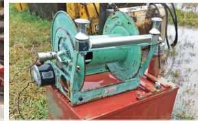
Hannay hose reel