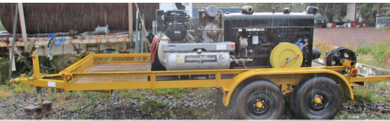
Assortment of trailers of varying sizes