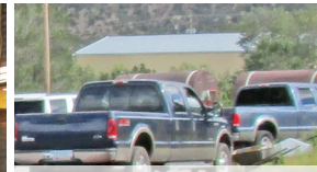
2006 Ford F-250 & F-350 diesel trucks