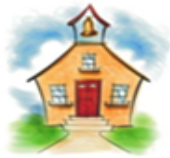
Middle School 1