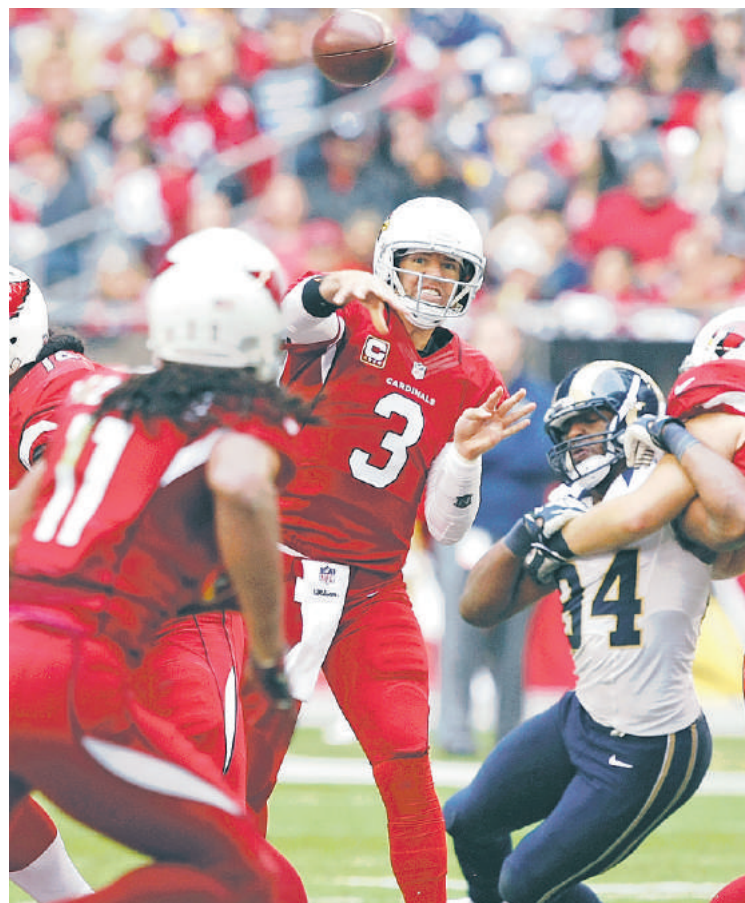
After throwing 13 interceptions and eight TDs in his first seven games, QB Carson Palmer finally has grasped the Cardinals' complicated offense.