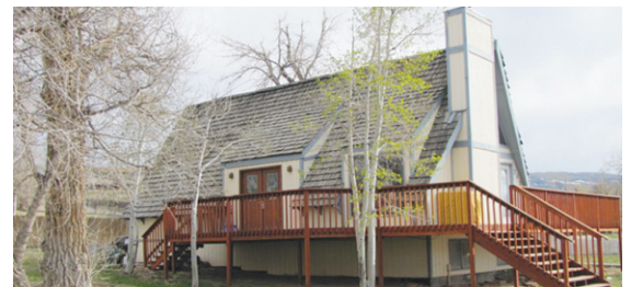
245 Aster $319,000

This cabin like feel "A" frame home has 5 bedrooms and 3 baths. Open living room, dining and kitchen area on the main floor with 2 bedrooms and 1 bath. The loft area has 1 bedroom on one end with a bath and the other end is a great area for an office that overlooks the living room. The downs stairs has a family room, a storage room, 2 more bedrooms, and a bathroom. This unique home sits on 18,000 square foot lot with a detached 2 car garage.