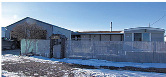
4086 Salt Creek Hwy $215,000

Be the first to tour this modified manufactured home on two full lots. Property features spacious living area (2,200 Square Feet), consisting of 2 bedrooms, possibly 3, 2 large bathrooms, master suite, new vinyl siding, new electric service, neatly manicured fenced in yard with auto sprinkler system, covered porch, decks and more. Also a 30 x 50 shop with massive extra parking.