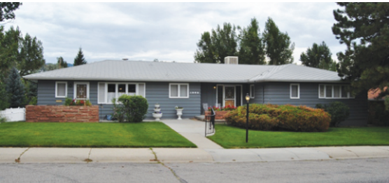
1805 Lynwood Place $369,900

Enjoy the peaceful sound of Garden Creek running through this lovely estate property. With five bedrooms and three baths, living room, huge family room with wet bar, and an amazing Forge wood fireplace/water fountain centered between the living room and dining area. Main level laundry, central air, walk-out basement, deck off the living room looks out over the beautifully landscaped backyard. Great home for entertaining. Mature, quiet neighborhood. RV parking with alley access. Automatic sprinkler system, newer electrical. Beautifully maintained home.