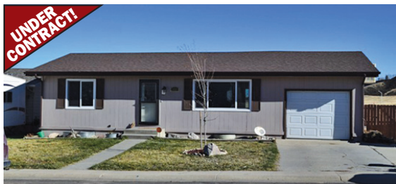
2925 Pheasant Drive $179,000

Newly Listed, beautiful west side home! Home boasts great views and access to many close amenities. This ranch style home has 3 bedrooms & 2 baths with large family room. You will find an attached 1 car garage. Updates include newly installed windows, carpet in living room and newer roof. Basement level features family room, master bedroom, full bathroom and laundry room. The master bedroom is non-conforming and has a large walk-in closet. Spend your spare time on the private back deck enjoying the landscaping and mountain views.