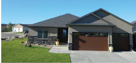
1620 Blue Spruce Drive $450,000

If you're looking for quality, you'll be impressed by this stunning 3 bedroom, 1.75 bath ranch located in an elite area on the east side of Casper. Enjoy the convenience of the maintenance free exterior, no yard work or snow removal (HOA does it!) and the attached 3 car garage. Luxury features include granite counters, huge kitchen island, heated tile floors in both bathrooms, custom Cole cabinets & Australian Hickory wood floors, and Pella windows. Master suite features a custom closet & gorgeous tile shower with seat. Main floor laundry & a full basement to finish as you choose. NEW CONSTRUCTION!