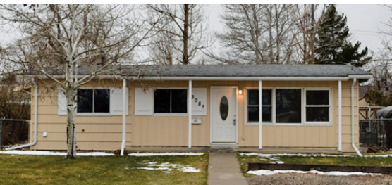
3085 Indiana Avenue $152,500

This eastside 3 bedroom, 1 bath home sits on a large lot with a great backyard. Traditional hardwood floors can be found throughout the home. Many new upgrades including: new roof, double pane windows, fresh paint inside & out, new carpet, new refrigerator & new plumbing fixtures. Forced air heating will keep you cozy all winter long. Outdoor amenities, swing set, storage shed, & mature landscaping. Within walking distance from University Park school.