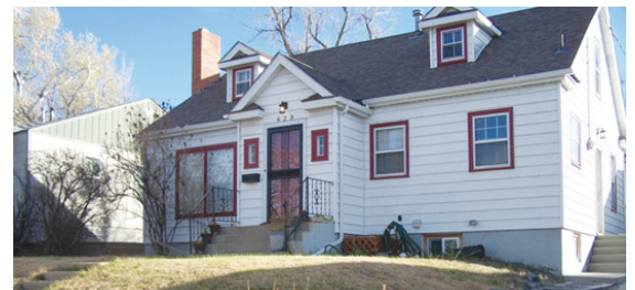
623 E. 13th Street $225,000

Cape Cod Style, located close to downtown. Well maintained and updated with lots of older home charm, including lots of storage. This home has 5 bedrooms, 1.75 bath, huge master suite upstairs, wood fireplace, and 2 car detached garage. All appliances remain including washer and dryer, newer furnace and central air. Private fenced in backyard.