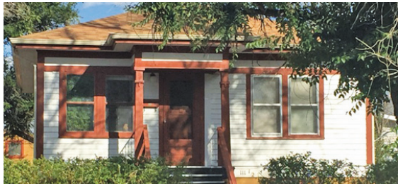
111 S. Jackson $145,000

This downtown Casper home features an enclosed porch, RV parking, kitchens and laundry on both levels, a huge garage /shop with separate electric service and offers close proximity to the hospital! Don't miss your chance to own this dual purpose home - for single family looking for extra income or for investors looking for 2 investment units.