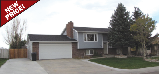
5020 S. Oak $253,900

This 4 bedroom 2 bath home offers a newer kitchen, 2 fireplaces, new roof, fantastic views from the covered deck and more. The estate sized lot boasts extensive RV parking, patio, new fencing, storage shed, plus oversized 2 car garage. All this in a great neighborhood.