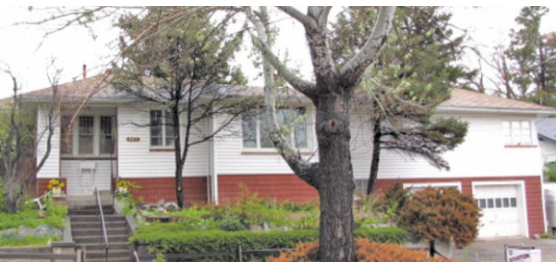
437 E. 13th Street $182,000

Unique property with amazing potential. This home features 2,222 square feet on main level plus an unfinished basement, 2 car garage, situated on 2 lots (14,000 square feet) with paved alley access, mature landscaping & more. Main level features hardwood floors, 4 bedrooms, 2 baths, formal dining, breakfast nook, fireplace, vintage charm. Needs work.