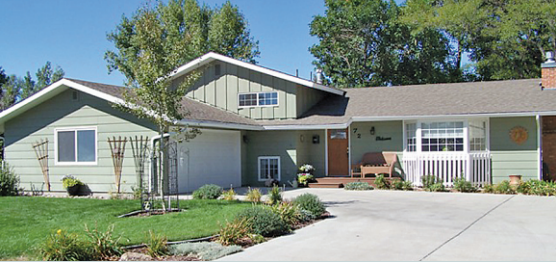
72 Marigold $265,000