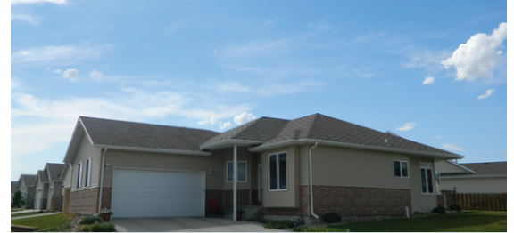
4161 Dartford Court $344,900

Cozy Fireplace, breakfast bar, formal dining area that opens to a large deck make for great entertaining in this large ranch style home on Casper's east side. Main floor laundry, master suite, full bath and 2 more bedrooms occupy the main floor. Plus the lower level features a huge family room, full bath, storage/utility room AND more bedrooms plus a craft room/bedroom. HURRY! NEW ROOF!