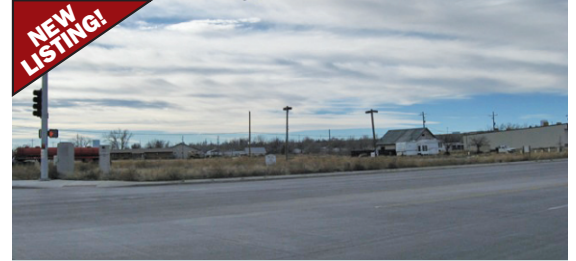
20/26 & Poison Spider $950,000

Commercial Land located near the signalized intersection of State Highway 20/26 and Poison Spider Road in Mills, Wyoming. Parcel is 31,806 square feet in size. Parcel may be purchased with an adjacent parcel of 58,321 square feet available at $617,500. Both parcels will encompass the entire corner, and total 2 acres in size. Total price for both parcels is $950,000.