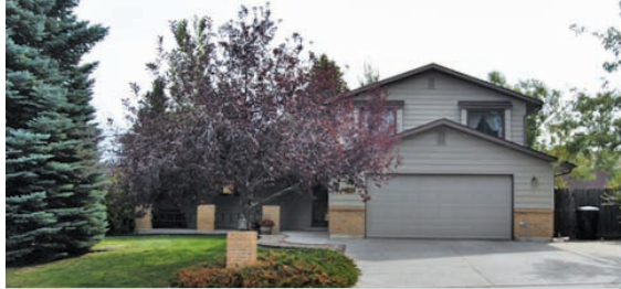
5021 East 16th Street $339,000

Lovely east side home! This four level home highlights four bedrooms and three and a half bathrooms. New roof, newer windows throughout home, some new electrical baseboard heaters. Two large family rooms; one with bricked wall fireplace and wet bar, the other has wall-to-wall built in bookshelves and cabinets. Nice updates in kitchen, and warm, rich block paneling throughout the living room and dining room. Great decks off of kitchen and master bedroom with a mountain view. Mature landscaping surrounds the home with a wonderful backyard for entertaining. Spotless clean and move-in ready!