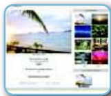
Photo Gallery is an interactive program capable of hosting multiple albums. Users can administer this program using the gallery administration available in the online administrative interface. Readers can even submit photos and comments on those posted.

www.townnews365.com/content_management_solutions/murlinstats