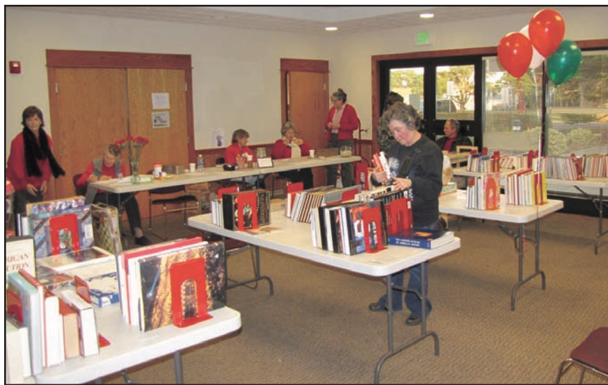
By Amy Moss Strong, Bandon Western World

Unity of Bandon is located on U.S. Highway 101 South, one mile south of 11th Street. For more information call 541-347-4696.