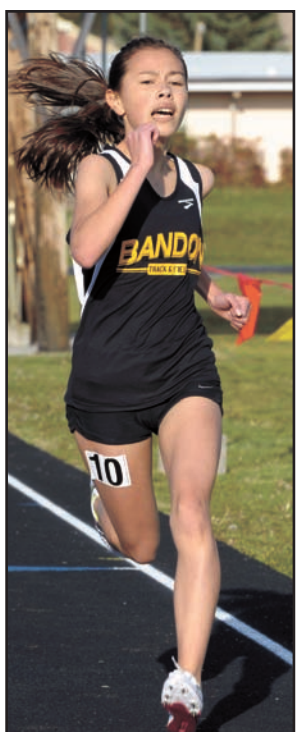
On to state

"My kids are thrilled to be running at Hayward