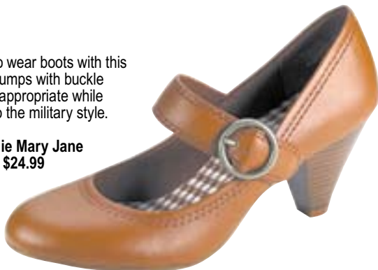
Women's Kimmie Mary Jane Pump, Payless, $24.99

You don't have to wear boots with this look. Feminine pumps with buckle details are work appropriate while remaining true to the military style.