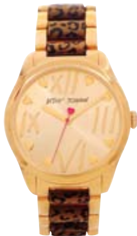
At first glance, Betsey Johnson's leopard metal watch appears to be no-nonsense. Look closer, and you'll see that feminine details abound. Glamorous without being girly, gold yet not stuffy, this watch will hit the mark every single time.

Navy blue is very much in style, and you can play on its nautical vibe by sporting it alongside red and white. Grey is incredibly versatile and tends to look good on every skin tone we're seeing it everywhere now from head to toe. Feminize the masculinity of many military pieces by adding a touch of pink, or even by including lace.