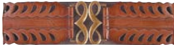
Daytrip Cut-Out Belt, Buckle, $16.95

Belts are an important part of fashion for their functionality, but they are also a way to add style. Cinched waists are popular in military-inspired looks, and belts made with elastic will create a lovely hourglass shape on any body when worn above the navel.