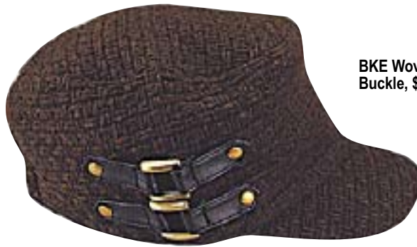
BKE Woven Knit Hat, Buckle, $12.60

Belts are an important part of fashion for their functionality, but they are also a way to add style. Cinched waists are popular in military-inspired looks, and belts made with elastic will create a lovely hourglass shape on any body when worn above the navel.