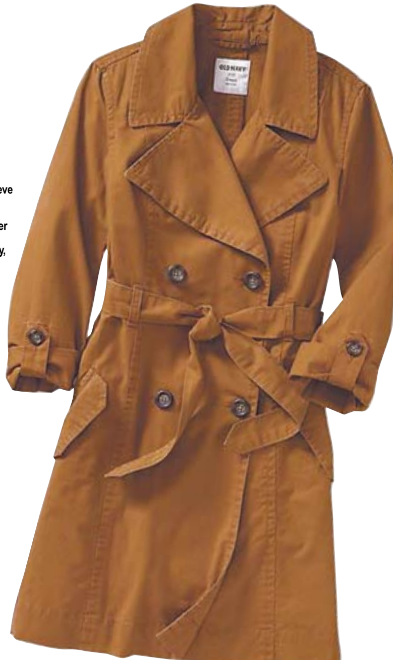
Tab-Sleeve Trench Coat in Bandolier Brown, Old Navy, $42

You don't have to wear boots with this look. Feminine pumps with buckle details are work appropriate while remaining true to the military style.