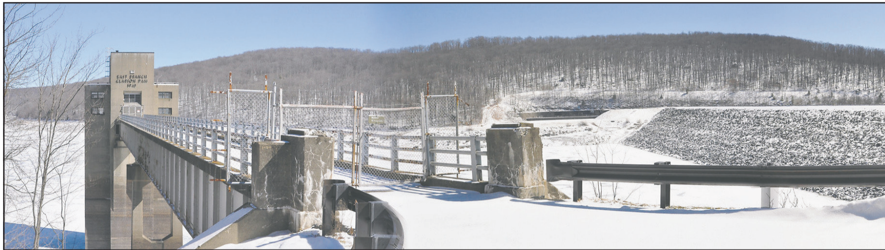
The U.S. Army Corps of Engineers, Pittsburgh District, reports that the President's Fiscal Year 2015 Budget includes $64.8 million for the East Branch Clarion River Lake Dam Safety Project in Elk County. The funds will be used to permanently address seepage-related concerns at the dam by constructing a 2,100-foot long, 260-foot deep concrete cutoff wall within the existing earthen dam.