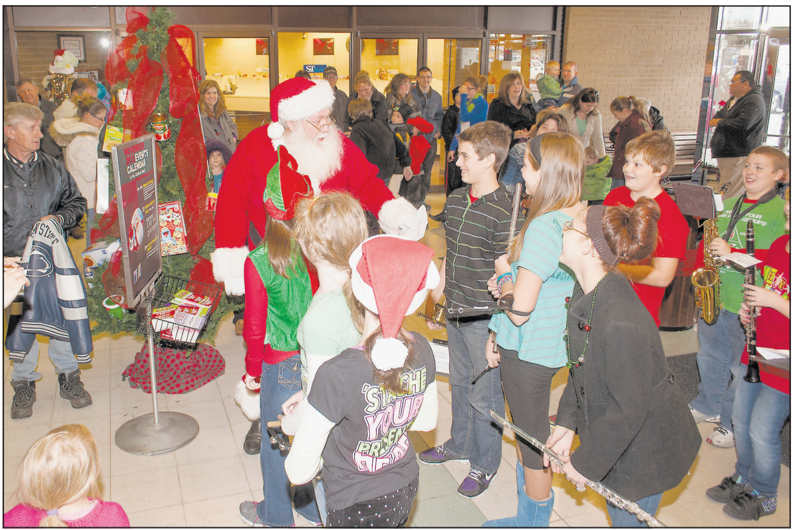
Santa Claus greets members of the DuBois Area Middle School band Saturday at the DuBois Mall after he arrived in a Sandy Township fire truck. The band then played while escorting him through the mall.