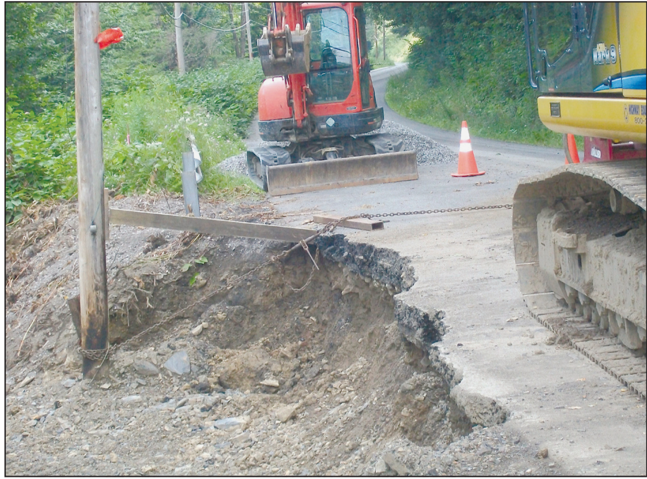
FLOOD DAMAGE — Three areas of the Clear Run Road in Sandy Township were destroyed in the June 27 flooding. Repairs were estimated at $100,000. The township is hoping repairs will be completed by the end of next week, however, the completion date is dependent on the availability of materials and also on the company resetting the guiderails.

Coming Monday Page 1 and the front sports page of the Courier-Express will have a new look Monday! The redesign will make the pages lighter, airier and easier to navigate.