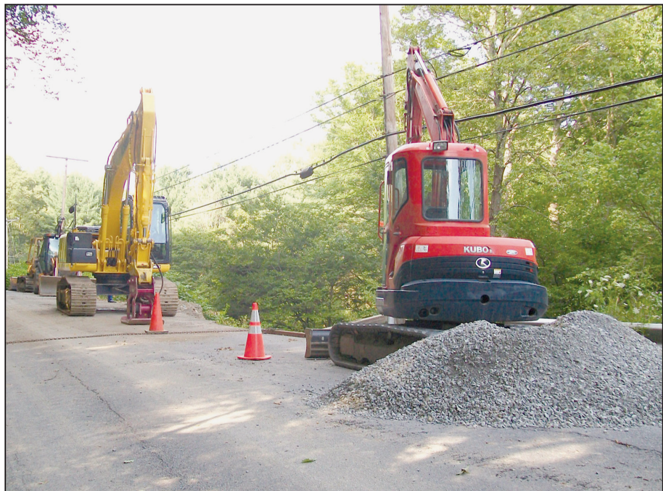
REPAIR WORK — The Clear Run Road in Sandy Township remains closed as work continues to repair the June 27 flood damage. Motorists are being detoured around the closed road by using Lundgren, Greenwood Cemetery and Gamelands roads.