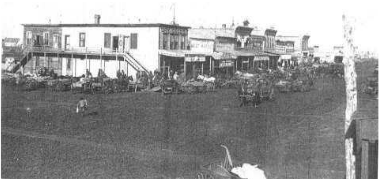
The Swope building at the intersection of Ninth and Main