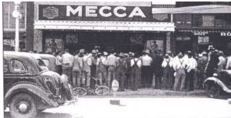
The Mecca Theatre