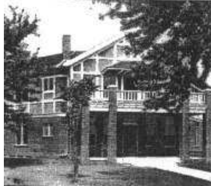
The Whittenberg Hospital

Turn back to Main and cross the street to the east side of the 700 block.