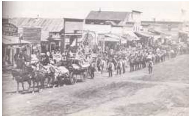
The west side of the 900 block around 1911. The Greiner Bros. Harness shop is on the far right and Swiler’s is four doors down from it.