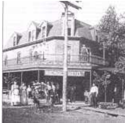
The Rains Hotel