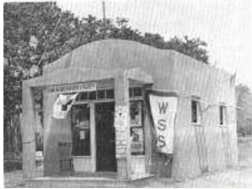
The War House