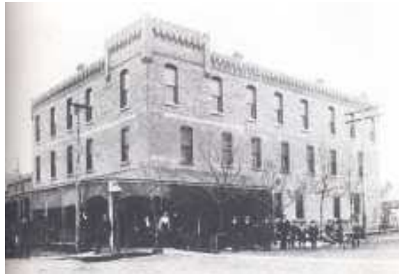
The Youst Hotel