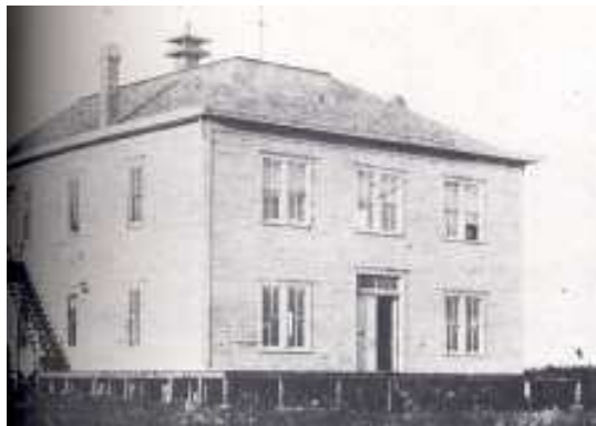
The First Courthouse