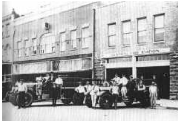
Fire Station No.1

North of the empty lot , you can still see the base of the old city water tower . It stood downtown between 1900 and 1966.