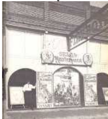
The Fireboys Theatre