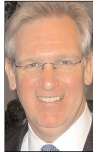
Gov. Jay Nixon

in November 1995. He retired from the court in July 2007.