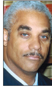
Judge George Draper