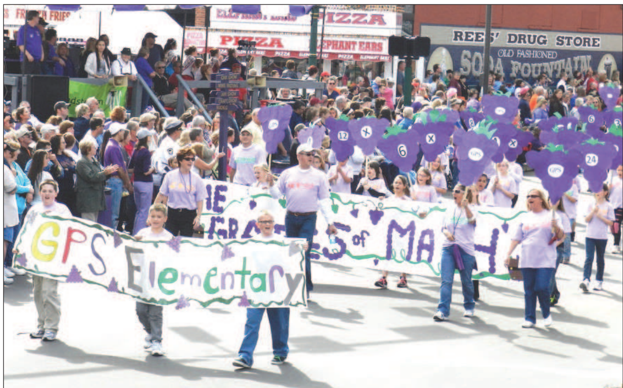
The Geneva Grape JAMboree features two parades: one on Saturday and one on Sunday.