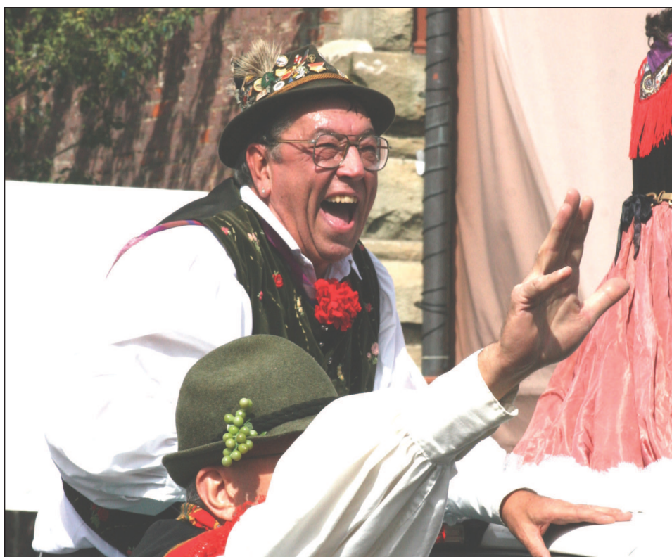
Slovenian dancers are among the many events and activities during JAMboree weekend.