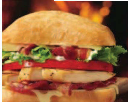
Chicken Bacon Ranch Sandwich