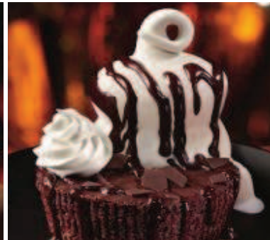
Triple Chocolate Brownie