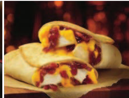
Chicken Bacon BBQ Snack Melt