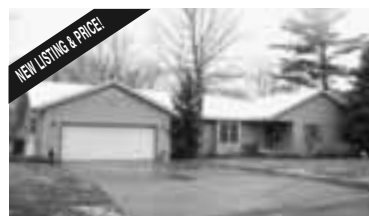
GENEVA - $169,900

7 BR. 4/5 Incredible Lake Erie Front Home * 2.74+/- Acres * Lake Erie Views in almost every Room * Large Gourmet Kitchen w/Granite, Ceramic Flrs, Cherry Cabinets, Breakfast Bar, High End Stainless Appl. * Hardwood Flrs * Bose Sound System/ *2 Int. Stairway * Multi-Tier Deck w/Hot Tub * Walk out Bsmt w/Bar * "Look Out" Patio