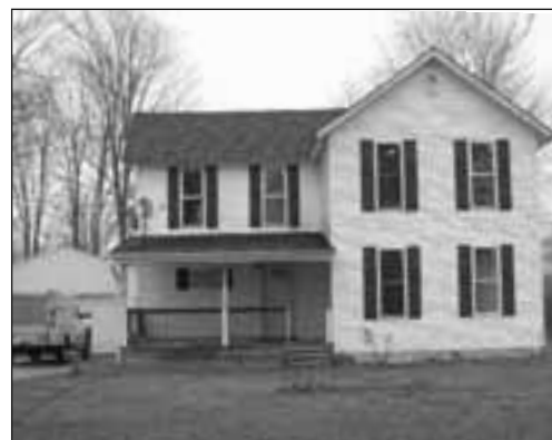
ROME, 3 bedroom, 2 full baths, 2 car detached garage, across from the Greenway trail. Come enjoy the nature.