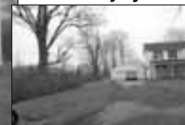
Call Vickie 858-5125 $109,900