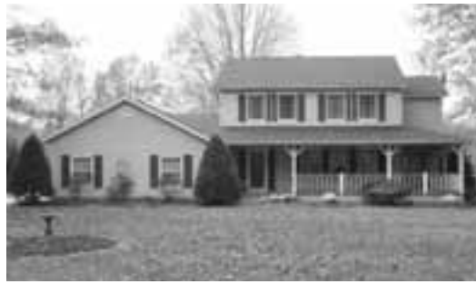
2025 ASHBROOK DR. SAYBROOK TWP.

Tasteful and terrific! This 4 bedroom 2.5 bath one-owner home is located in the Ashbrook development just off Carpenter Rd. Featuring an open floor plan that has proven to be perfect for entertaining, with the eat-in kitchen and family room with fireplace open to one another. 1st floor laundry, a living room, dining room plus an added living space in the partially finished basement. The main bath on the 2nd floor has been recently renovated with quality materials and craftsmanship. The master bedroom offers 2 large closets as well as a master bath. Vinyl sided, concrete drive and includes a large, private multi-level deck plus a large covered front porch. Newer furnace and AC, 2+ car attached garage, plus a storage shed all set on a large lot in an area of similarly built high quality homes. A lot to like in this beauty! $219,900 Call Rick 440-862-0906