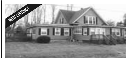
GENEVA - $99,900

3 Rental Units on 1 Lot * A Single Family & a Duplex * 3 Car Det Garage w/Bays for each Unit * Fresh Paint & Some Carpet.