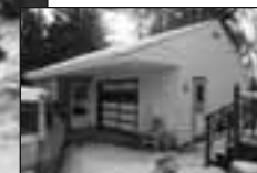
Call Jim 669-2262 $79,900