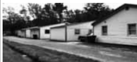
GENEVA — $149,900

2 BR Ranch * Almost 1/2 Acre On Hillside * Deck Updated Kit-Din w/appl * Liv Rm. w/Gas FP * Part. Fin. Bsmt w/workshop & 2 extra rooms.