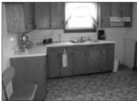
JEFFERSON VILLAGE, 2 bedroom, corner lot with 1 1/2 car garage with workshop, full basement, finished attic. Call Ed 223-1410