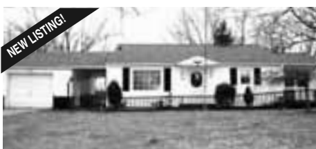
GENEVA - $69,900

6 or 7 Colonial on Double Lot * 3 Baths * Central Air * Partial Basement * Deck * Handicapped Accessible