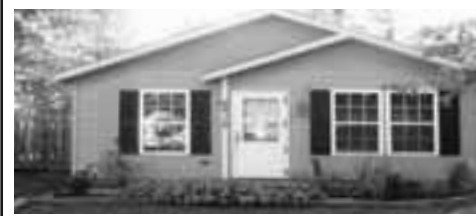
GENEVA ON THE LAKE - $78,300

Great Investment * 5 Free Standing Apartments * Units include 3 BR, 1 - 1 BR & 3 2 BR apts and Privacy Fence * New Sewer Line, Access Drive, Roofs - (2010 - 2012) & Many Improvements.