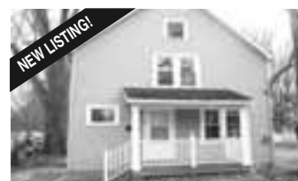
GENEVA — $141,000

3 bedrooms & 2.5 bath ranch on double lot Liv. rm & din. rm combo * Kit. w/appliance, Fam. rm w/GasFP & Master w/Mstr BA & Sunroom, Rec Room in Bsmt.