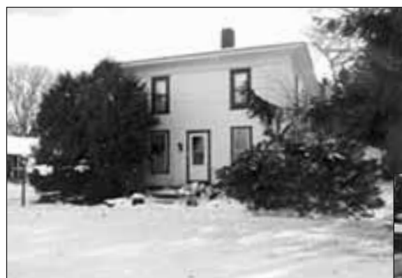
JEFFERSON VILLAGE, 4 bedroom, full basement on 2 acres detached garage.