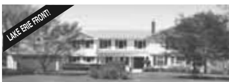
ASHTABULA — $699,900

7 BR. 4/5 Incredible Lake Erie Front Home * 2.74+/- Acres * Lake Erie Views in almost every Room * Large Gourmet Kitchen w/Granite, Ceramic Flrs, Cherry Cabinets, Breakfast Bar, High End Stainless Appl. * Hardwood Flrs * Bose Sound System/ *2 Int. Stairway * Multi-Tier Deck w/Hot Tub * Walk out Bsmt w/Bar * "Look Out" Patio