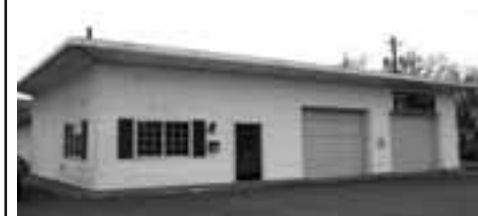
GENEVA — $ 47,900

3 BR, 2 BA ranch * Kit. w/Oak Cabients & Appliances * Master Suite w/Walk-in closet & Bath * Deck * Shed * Workshop * Full Privacy Fence.