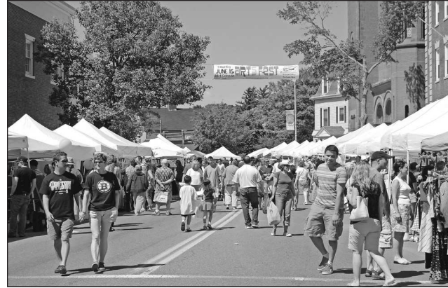
Cabot Street will be filled with artists, musicians, good food and fun for the children.

At past festivals, there have always been more artists than the festival could accommodate, but room has been added this year around Ellis Square.