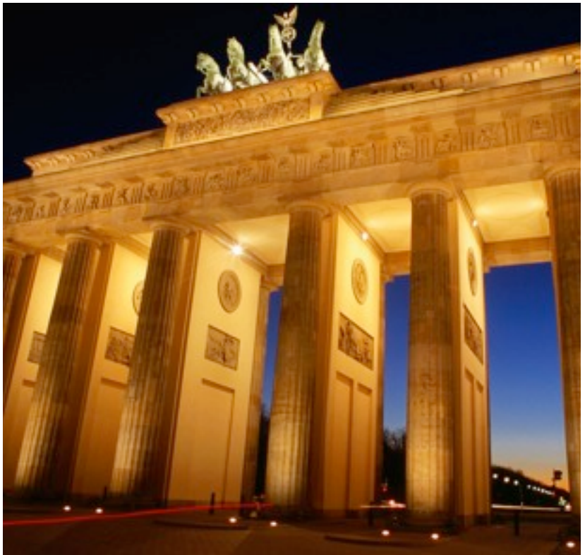
The Brandenburg Gate - Berlin