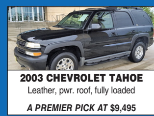
2003 CHEVROLET TAHOE Leather, pwr. roof, fully loaded A PREMIER PICK AT $9,495