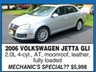
2006 VOLKSWAGEN JETTA GLI 2.0L 4-cyl., AT, moonroof, leather, fully loaded MECHANIC'S SPECIAL?? $5,998