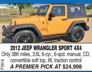
2012 JEEP WRANGLER SPORT 4X4 Only 38K miles, 3.6L 6-cyl., 6-spd. manual, CD, convertible soft top, tilt, traction control A PREMIER PICK AT $24,998