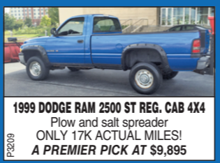
1999 DODGE RAM 2500 ST REG. CAB 4X4 Plow and salt spreader ONLY 17K ACTUAL MILES! A PREMIER PICK AT $9,895