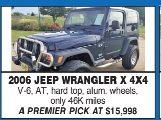
2006 JEEP WRANGLER X 4X4 V-6, AT, hard top, alum. wheels, only 46K miles A PREMIER PICK AT $15,998