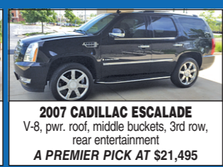
2007 CADILLAC ESCALADE V-8, pwr. roof, middle buckets, 3rd row, rear entertainment A PREMIER PICK AT $21,495