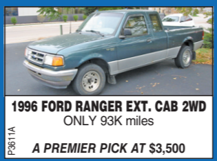
1996 FORD RANGER EXT. CAB 2WD ONLY 93K miles A PREMIER PICK AT $3,500