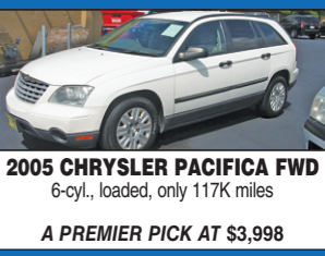
2005 CHRYSLER PACIFICA FWD 6-cyl., loaded, only 117K miles A PREMIER PICK AT $3,998