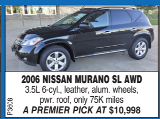
2006 NISSAN MURANO SL AWD 3.5L 6-cyl., leather, alum. wheels, pwr. roof, only 75K miles A PREMIER PICK AT $10,998