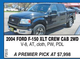
2004 FORD F-150 XLT CREW CAB 2WD V-8, AT, cloth, PW, PDL A PREMIER PICK AT $7,998