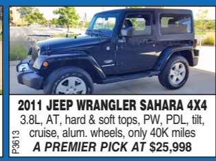
2011 JEEP WRANGLER SAHARA 4X4 3.8L, AT, hard & soft tops, PW, PDL, tilt, cruise, alum. wheels, only 40K miles A PREMIER PICK AT $25,998