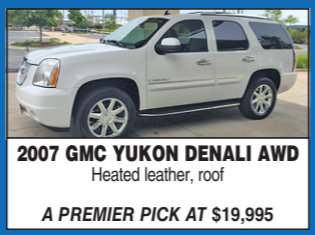
2007 GMC YUKON DENALI AWD Heated leather, roof A PREMIER PICK AT $19,995