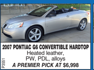
2007 PONTIAC G6 CONVERTIBLE HARDTOP Heated leather, PW, PDL, alloys A PREMIER PICK AT $6,998