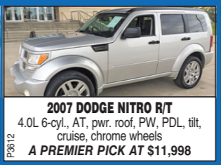
2007 DODGE NITRO R/T 4.0L 6-cyl., AT, pwr. roof, PW, PDL, tilt, cruise, chrome wheels A PREMIER PICK AT $11,998