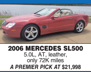
2006 MERCEDES SL500 5.0L, AT, leather, only 72K miles A PREMIER PICK AT $21,998