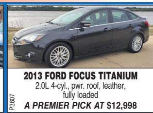
2013 FORD FOCUS TITANIUM 2.0L 4-cyl., pwr. roof, leather, fully loaded A PREMIER PICK AT $12,998