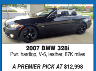
2007 BMW 328i Pwr. hardtop, V-6, leather, 87K miles A PREMIER PICK AT $12,998