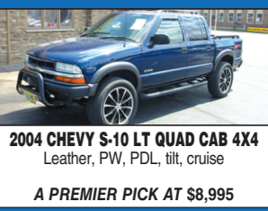
2004 CHEVY S-10 LT QUAD CAB 4X4 Leather, PW, PDL, tilt, cruise A PREMIER PICK AT $8,995