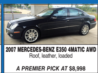
2007 MERCEDES-BENZ E350 4MATIC AWD Roof, leather, loaded A PREMIER PICK AT $8,998