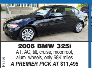
2006 BMW 325i AT, AC, tilt, cruise, moonroof, alum. wheels, only 68K miles A PREMIER PICK AT $11,495