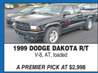
1999 DODGE DAKOTA R/T V-8, AT, loaded A PREMIER PICK AT $2,998