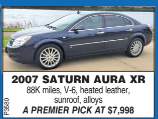
2007 SATURN AURA XR 88K miles, V-6, heated leather, sunroof, alloys A PREMIER PICK AT $7,998