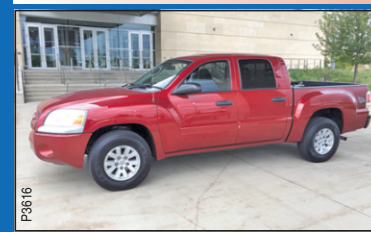
2006 MITSUBISHI RAIDER LS CREW CAB 4X4 3.7L 6-cyl., AT, PW, PDL, tilt, cruise, alum. wheels, super clean A PREMIER PICK AT $10,998