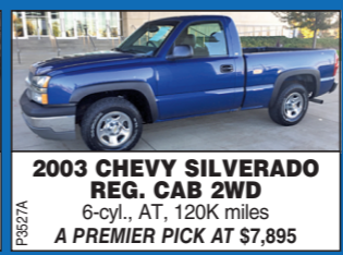
2003 CHEVY SILVERADO REG. CAB 2WD 6-cyl., AT, 120K miles A PREMIER PICK AT $7,895