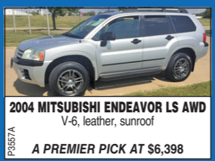
2004 MITSUBISHI ENDEAVOR LS AWD V-6, leather, sunroof A PREMIER PICK AT $6,398