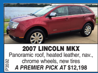
2007 LINCOLN MKX Panoramic roof, heated leather, nav., chrome wheels, new tires A PREMIER PICK AT $12,198