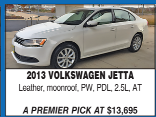
2013 VOLKSWAGEN JETTA Leather, moonroof, PW, PDL, 2.5L, AT A PREMIER PICK AT $13,695