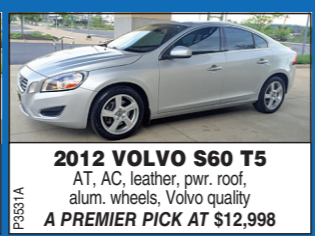
2012 VOLVO S60 T5 AT, AC, leather, pwr. roof, alum. wheels, Volvo quality A PREMIER PICK AT $12,998