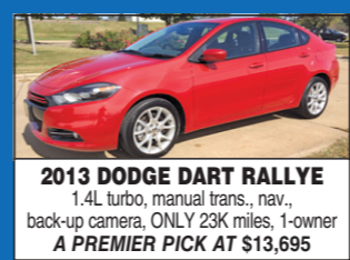
2013 DODGE DART RALLYE 1.4L turbo, manual trans., nav., back-up camera, ONLY 23K miles, 1-owner A PREMIER PICK AT $13,695