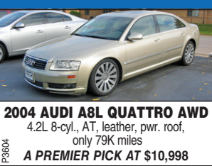
2004 AUDI A8L QUATTRO AWD 4.2L 8-cyl., AT, leather, pwr. roof, only 79K miles A PREMIER PICK AT $10,998