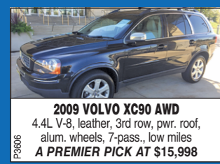
2009 VOLVO XC90 AWD 4.4L V-8, leather, 3rd row, pwr. roof, alum. wheels, 7-pass., low miles A PREMIER PICK AT $15,998