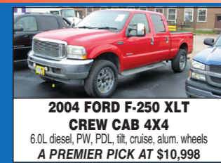
2004 FORD F-250 XLT CREW CAB 4X4 6.0L diesel, PW, PDL, tilt, cruise, alum. wheels A PREMIER PICK AT $10,998