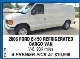
2006 FORD E-150 REFRIGERATED CARGO VAN V-8, 93K miles A PREMIER PICK AT $10,998