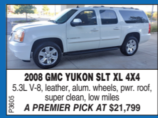
2008 GMC YUKON SLT XL 4X4 5.3L V-8, leather, alum. wheels, pwr. roof, super clean, low miles A PREMIER PICK AT $21,799