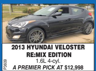
2013 HYUNDAI VELOSTER RE:MIX EDITION 1.6L 4-cyl. A PREMIER PICK AT $12,998