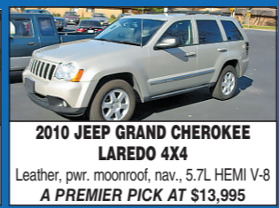
2010 JEEP GRAND CHEROKEE LAREDO 4X4 Leather, pwr. moonroof, nav., 5.7L HEMI V-8 A PREMIER PICK AT $13,995