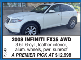
2008 INFINITI FX35 AWD 3.5L 6-cyl., leather interior, alum. wheels, pwr. sunroof A PREMIER PICK AT $12,998