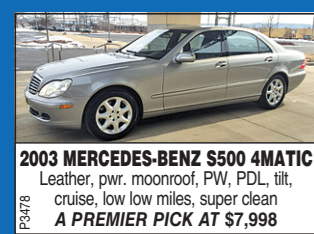
2003 MERCEDES-BENZ S500 4MATIC Leather, pwr. moonroof, PW, PDL, tilt, cruise, low low miles, super clean A PREMIER PICK AT $7,998