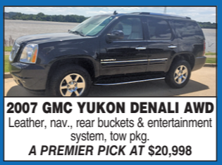
2007 GMC YUKON DENALI AWD Leather, nav., rear buckets & entertainment system, tow pkg. A PREMIER PICK AT $20,998