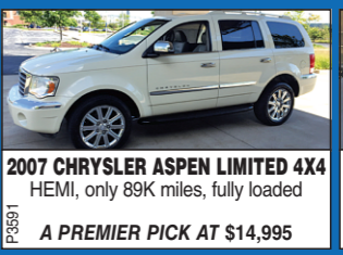
2007 CHRYSLER ASPEN LIMITED 4X4 HEMI, only 89K miles, fully loaded A PREMIER PICK AT $14,995