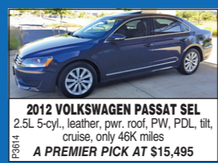
2012 VOLKSWAGEN PASSAT SEL 2.5L 5-cyl., leather, pwr. roof, PW, PDL, tilt, cruise, only 46K miles A PREMIER PICK AT $15,495