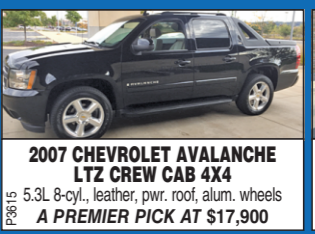
2007 CHEVROLET AVALANCHE LTZ CREW CAB 4X4 5.3L 8-cyl., leather, pwr. roof, alum. wheels A PREMIER PICK AT $17,900