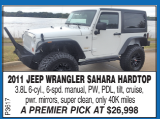
2011 JEEP WRANGLER SAHARA HARDTOP 3.8L 6-cyl., 6-spd. manual, PW, PDL, tilt, cruise, pwr. mirrors, super clean, only 40K miles A PREMIER PICK AT $26,998