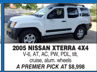
2005 NISSAN XTERRA 4X4 V-6, AT, AC, PW, PDL, tilt, cruise, alum. wheels A PREMIER PICK AT $8,998