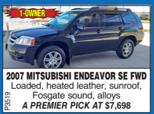
2007 MITSUBISHI ENDEAVOR SE FWD Loaded, heated leather, sunroof, Fosgate sound, alloys A PREMIER PICK AT $7,698