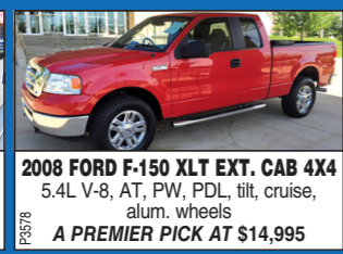
2008 FORD F-150 XLT EXT. CAB 4X4 5.4L V-8, AT, PW, PDL, tilt, cruise, alum. wheels A PREMIER PICK AT $14,995