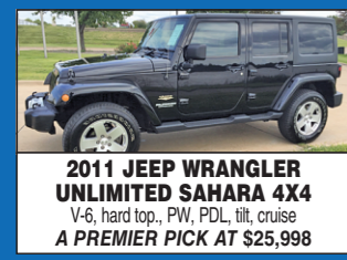
2011 JEEP WRANGLER UNLIMITED SAHARA 4X4 V-6, hard top, PW, PDL, tilt, cruise A PREMIER PICK AT $25,998