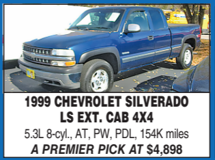
1999 CHEVROLET SILVERADO LS EXT. CAB 4X4 5.3L 8-cyl., AT, PW, PDL, 154K miles A PREMIER PICK AT $4,898