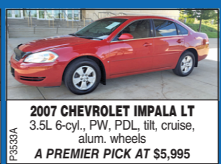
2007 CHEVROLET IMPALA LT 3.5L 6-cyl., PW, PDL, tilt, cruise, alum. wheels A PREMIER PICK AT $5,995