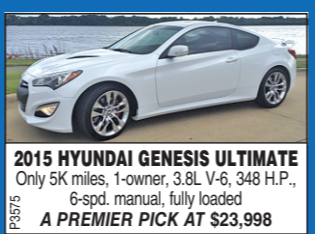
2015 HYUNDAI GENESIS ULTIMATE Only 5K miles, 1-owner, 3.8L V-6, 348 H.P., 6-spd. manual, fully loaded A PREMIER PICK AT $23,998