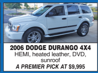
2006 DODGE DURANGO 4X4 HEMI, heated leather, DVD, sunroof A PREMIER PICK AT $9,995