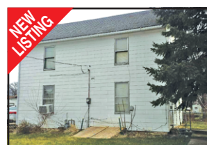
310 Walnut Street, Wilton $58,500

A great downtown location in Wilton awaits for office or retail space. Currently used as an office supply store but could be used to house 5 or 6 private offices and reception area. Attractive brick front, seamless roofing system. Ready for your new or expanding venture. Call for your appointment soon, buildings in the downtown do not come up for sale very often.