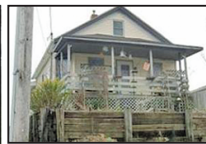
710 Newell Ave $71,500

Quiet & Tranquil setting just minutes from Muscatine. Take the short drive out G-28 to Hilltop Drive to see this 4 bdrm 2 bthrm home w/ formal dining rm, updated kitchen w/Birch Legacy Cabinets, screened deck, finished lower level w/ wood fireplace & attached 2 stall garage. Great subdivision w/community pool & $600 annual HOA fees. Reliable REC Electric & Alliant Gas. Nicely landscaped & well maintained.