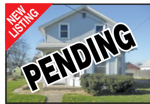
116 Cook Street, Muscatine $63,500

Handy Man Special in Great Neighborhood. This home has great potential for the new owner/ investor. The interior will need paint some flooring. 2 bdrms, 1 bthrm 2 stall garage under home w/ alley access. Roof will need shingled. FHA & VA will not loan on this property. Conventional financing or cash only. Home will be sold in AS IS condition. Refrigerator, stove, deep freeze included, great 1st investment.