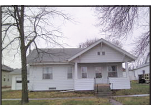
210 W 6th Street, Tipton $79,900

Well Cared for 3 bedroom 1 bathroom home with updates! Plenty of main level living space. Recent updates include: New Steel Roof, recent paint, and floor coverings. A must see home on a large corner lot in West Liberty. "Investors" this home is currently rented out at $900.00 per month and tenants want to stay... However their contract states they may have to move out if sold to new Homeowner