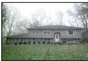
2282 N Hilltop, Muscatine $189,500

Fisherman's paradise! This waterfront property is NOT on leased ground w/boat ramp, covered fish cleaning station, 3 stall detached heated workshop & is ready for year round living or a weekend retreat. This 3 bdrm 2 bthrm home was built in 1995 w/2x6 construction, main level laundry 2 stall attached garage & HUGE 4 seasons room surrounded with glass for great river views. DID NOT FLOOD IN 2008 OR 2013.