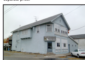
119 Cherry Street, Atalissa $129,000

EXCELLENT CORNER LOT LOCATION for this large 2 bedroom 2 bathroom home with main level laundry, open kitchen/dining room, large living room, finished 2 stall garage and plenty of room for expansion in the lower level with a rough in for a 3rd bathroom. Lower level could also have a large family room and 3rd bedroom if an egress window were installed. Don't delay, call today.