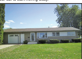
52 Mulberry Street, Tipton, IA $95,000

Nicely updated 2 bedroom 1 bathroom home with main level laundry, complete appliance package and 1 stall garage with alley access. This a great opportunity for the first time home buyer, down sizer or investor. Make sure to put this one on your list. Recent Updates: 2011: Furnace. 2012: All new plumbing, Electrical Service.