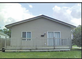
614 Adams Street, Muscatine, IA $59,500

Just off of Lucas Street this home on Cook Street has 3 bedrooms 2 bathrooms and a 2 stall detached garage. Asset#161-298685. Property is HUD owned & sold 'as-is' without any repairs or warranties. For more information concerning electronic bidding deadlines & procedures, earnest money & any defects known, refer to www.hudhomestore.com or www.mmrem.com