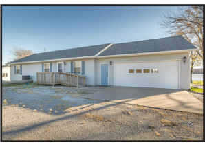
3758 Midway Beach Road, Muscatine, IA $230,000

Prime Commercial ALL Brick Building with hard surface parking lot and lighting located on Grandview Ave in Muscatine Iowa. Prime Exposure for all your clientele. This location would make a prime used car facility, Small Department Store, Pharmacy- Drug Store. This was a bank location so the drive up tellers are still there.