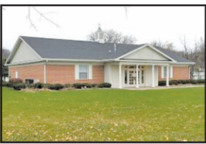
401 Grandview Ave. $354,900

Prime Commercial ALL Brick Building with hard surface parking lot and lighting located on Grandview Ave in Muscatine Iowa. Prime Exposure for all your clientele. This location would make a prime used car facility, Small Department Store, Pharmacy- Drug Store. This was a bank location so the drive up tellers are still there.