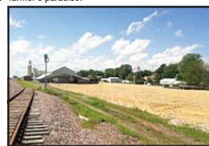
501 E Cedar, Mechanicsville $230,000

The welcome mat is out for this 4 bdrm 3 bthrm home w/4 stall finished tandem garage on a corner lot in The Meadows in Wilton. This home has a large master suite w/whirlpool tub & separate shower, granite counters, finished lower level complete with family room and rec room, hard wood flooring, open floor plan, gas fireplace, private deck. Wall in garage needs removed to hold 4 cars.