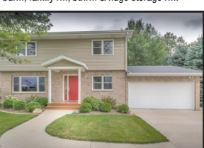
901 11th Ave, Durant, IA $194,500

Brand new spacious no step 2 bedrm condo with open floor plan and everything on the main level. 12" Sound proof common wall, breakfast bar, hardwood flooring, tile, huge master with walk in closet, fireplace, cathedral ceilings, full bsmt. w/ egress window and rough in, Great location, close to new library and community center. Seller is a licensed real estate agent in Iowa.