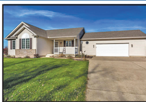
619 W Wate Street, Wilton, IA $239,900

PRIME LOCATION! 20 minutes from the Quad Cities, 30 Minutes from Iowa City & Muscatine with 1.3 acres on pavement. Come take a look at this spacious home w/open floor plan, 3 bthrms, 2 main level bdrms & 2 non conforming basement bdrms. (2 exits from basement, but no egress windows.) Several other amenities: sun room, hard wired back up generator, 2 stall finished garage, elegant landscaping, 2 fire places.