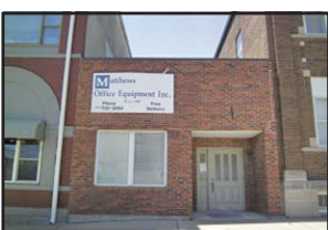
403 Cedar Street, Wilton $69,000

6 separate buildings with 14 storage units. 11) 10x20 units rent for $53.50 each. 3) 8x12 units rent for $32.10 each. Annual gross income: $8,217.60. Less: Sales tax: $537.60. Insurance: $600. Property Taxes: $1,600. NET ANNUAL INCOME: $5,480. 7.6% Cap rate on investment. PLENTY OF ROOM TO ADD SEVERAL MORE BUILDINGS. SEE LISTING AGENT FOR SELLER PLAN.