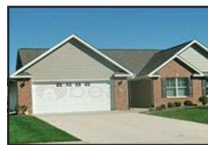
413 E Prairie, Wilton $215,000

Great Hwy 30 Exposure to this commercial lot with big truck route streets to the property, also has a railroad spur what more could you ask for? Lots of Opportunity for a great business location. Customer is selling Property from Walnut Street Centerline, to the East and all of Parcel #0440-01-24-234-005-0 If Someone wanted Old Auction Building can be bought separate price.