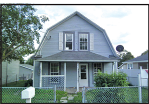
2216 New Hampshire $49,995

Completely remodeled in 2010: 2 bedroom 1 bathroom home on a quiet street. ALL NEW: Windows, Siding, Furnace, Wiring, Insulation, Drywall, and Plumbing. New steel roof in 2015. Perfect for a first time home buyer or rental. Corner lot, huge yard shed and nice front deck. Basement is a dirt floor, owner could install concrete for an extra cost.