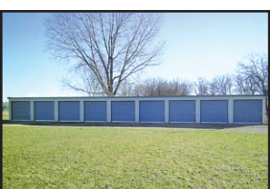
2322 Hwy 30, Lowden $72,500

Fresh cleaning and interior paint await you with 2 bedrooms, 1 bathroom, large living room and single stall garage. Quiet location close to everything you need. Inviting front porch, central air, make sure to put this one on your list.