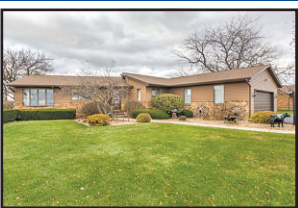
20375 20th Ave, Stockton $267,900

Centrally located home perfect for 20 minute commute to Muscatine, Iowa City or Davenport. Perfectly finished newer home with 4-5 bdrms, 4 BA, screened porch, deck, vaulted ceiling, huge master suite w/balcony, and walk out finished basement. Under home storage shed/ workshop and detached storage shed. Wooded 1.31 Acre lot gives you plenty of privacy. Complete appliance package make for an easy move in.