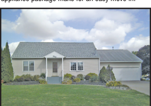
313 E 6th Street, Wilton, IA $159,900

Move right in w/4 bdrms, 2 bthrms, 2 stall attached garage, main level laundry, finished lower level & 24' above ground pool w/maintenance free deck. Recent updates include: 2009: New kitchen w/corion counters & 200 amp electrical service. 2011: Furnace. 2012: brick, vinyl siding & windows. Located on a quiet dead end street just blocks from the school and park. Make your call to start moving today.