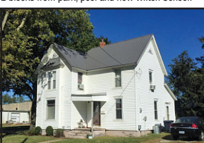
309 W. 6th St., West Liberty $94,900

A Quiet location in Tipton awaits you with 3 bedrooms, 2 bathrooms and a single stall attached garage. Great starter home or investment, interest rates are still low so now is the time to call for your appointment to see this home. All new floor coverings and paint.