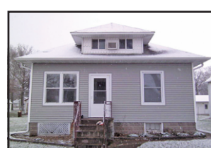
1004 5th Street, Durant $105,000

Great Turn Key Business! Kitty's Long Branch Saloon comes complete with: 2 parcels of land, bar equipment, shell for a convenience store w/walk in cooler equipment, storage building, outdoor beer garden & serving area. 3 Bdrm apartment has long term tenant that helps cut overhead, separate utilities except water and all appliances.