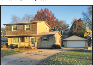
617 W 6th St., Wilton $149,900

Great location for this 3 bedroom 2 bathroom home with waterproofed basement, new roof in 2014, new french doors and patio in 2006 and tandem 4 stall heated garage. Large living room and open dining area, nice sized kitchen w/walk in pantry, full appliance package including stove, refrigerator, dishwasher, deep freeze, washer & dryer. 2 blocks from park, pool and new Wilton School.