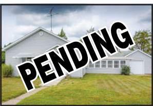
3305 Grandview Avenue $52,700

This 2 bedroom 1 bathroom home has nice vinyl siding and a fenced yard. Plenty of room to build a nice garage. The main level has a living room, formal dining room, full bathroom, kitchen and laundry room. The second level has 2 bedrooms. Great investment, call today.