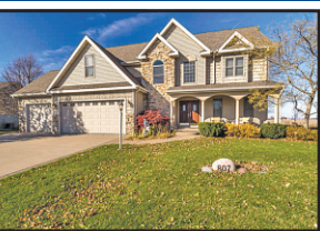
807 Wild Rose Road, Wilton, IA $299,500

Exquisite 5 bdrm 4 bthrm custom built home w/3 stall garage & finished lower level. 2 story foyer will greet your guests just outside the large living rm w/hardwood flooring & gas fireplace. Open kitchen w/breakfast bar and access to the 2 level deck. Main level also has 1 bdrm 1 bthrm & office nook. 2nd level has 3 spacious bdrms & 2 bthrms. Lower level has 1 bdrm, family rm, bthrm & huge storage rm.