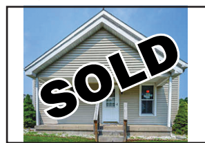
1603 Indiana $49,900

Just off 47th Ave this home on Grandview Ave has 2 bedrooms 2 bathrooms and a 1 stall attached garage. Asset#161-265993. Property is HUD owned & sold 'as-is' without any repairs or warranties. For more information concerning electronic bidding deadlines & procedures, earnest money & any defects known, refer to www.hudhomestore.com or www.mmrem.com