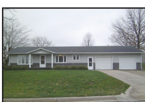
620 E 6th Street, Wilton $149,500

This 2 Story, 4 bedroom home comes with 1-1/2 bath. Make this Home Yours, before someone else does! All New Vinyl Windows!