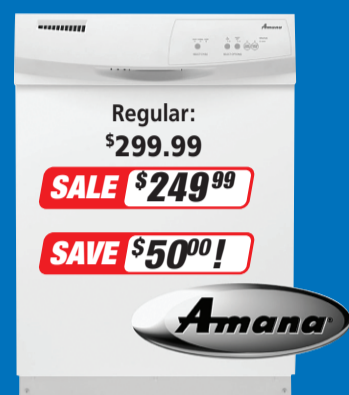
Amana Dishwasher ADB110AAW