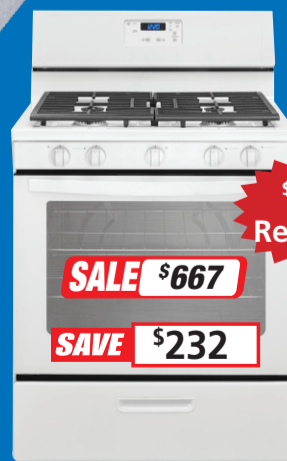
WFG530COEW Reg $899