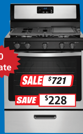
WFG530COES Reg $949