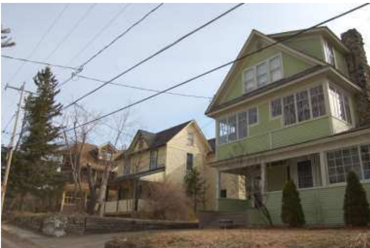
Name of Property: Helen Hill District City or Vicinity: Saranac Lake County: Essex and State: NY Date Photographed: 4/25/2014 Description of Photograph(s) and number: Shepard Avenue facing northeast. R-L #90, 94, 98 (Map IDs 37, 39, 41) 3 of 21