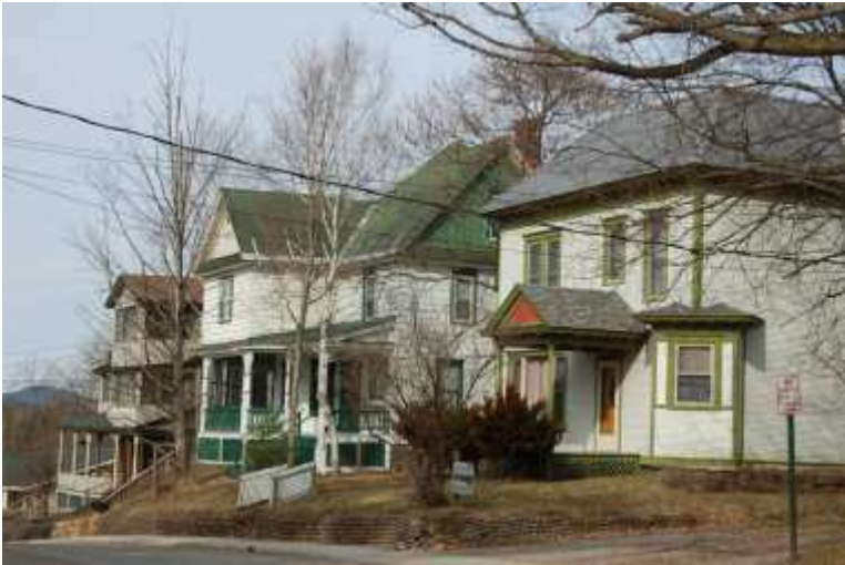
Name of Property: Helen Hill District City or Vicinity: Saranac Lake County: Essex and Franklin State: NY Date Photographed: 4/25/2014 Description of Photograph(s) and number: Helen Street at intersection of Shepard Avenue facing west. L-R #35, 39, 43 (Map IDs 01, 02, 03) 1 of 21