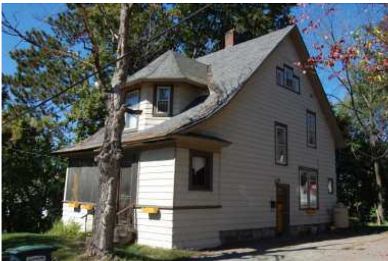
Name of Property: Helen Hill District City or Vicinity: Saranac Lake County: Essex and Franklin State: NY Date Photographed: 9/19/2013 Description of Photograph(s) and number: 30 Prescott Place, facing west. (Map ID 26) 20 of 21