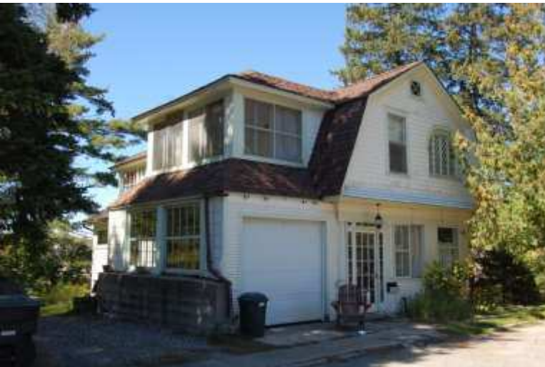
Name of Property: Helen Hill District City or Vicinity: Saranac Lake County: Essex and Franklin State: NY Date Photographed: 9/19/2013 Description of Photograph(s) and number: 137 Shepard Avenue, facing northwest. (Map ID 46) 14 of 21