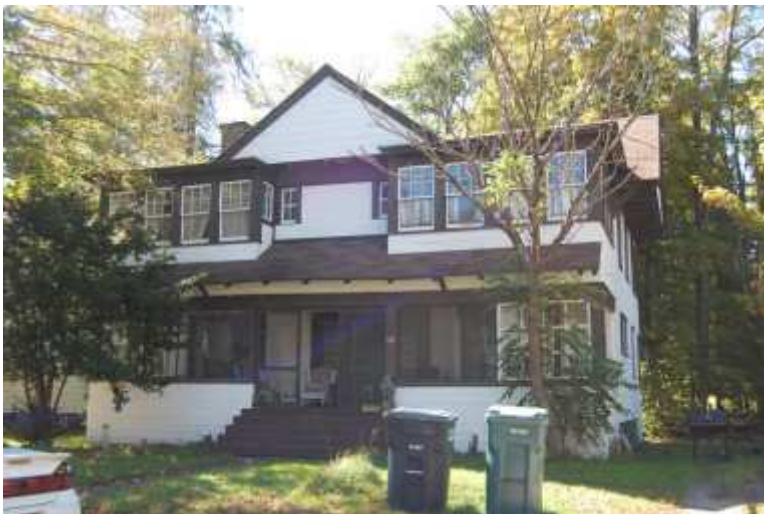
Name of Property: Helen Hill District City or Vicinity: Saranac Lake County: Essex and Franklin State: NY Date Photographed: 9/19/2013 Description of Photograph(s) and number: 107 Franklin Avenue, facing west. (Map ID 68) 17 of 21