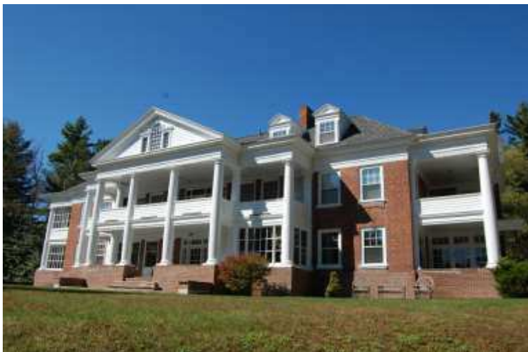
Name of Property: Helen Hill District City or Vicinity: Saranac Lake County: Essex and Franklin State: NY Date Photographed: 9/19/2013 Description of Photograph(s) and number: 129 Franklin Avenue, facing north. (Map ID 73) 18 of 21