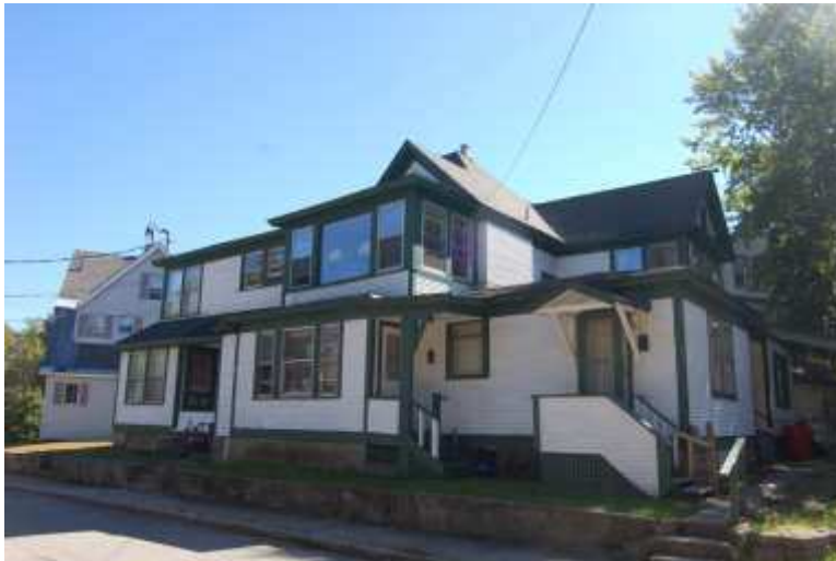
Name of Property: Helen Hill District City or Vicinity: Saranac Lake County: Essex and Franklin State: NY Date Photographed: 9/19/2013 Description of Photograph(s) and number: 9 Prescott Place, facing east. (Map ID 18) 16 of 21