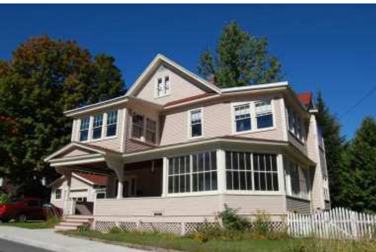
Name of Property: Helen Hill District City or Vicinity: Saranac Lake County: Essex and Franklin State: NY Date Photographed: 9/19/2013 Description of Photograph(s) and number: 103 Helen Street facing north. (Map ID 14) 15 of 21