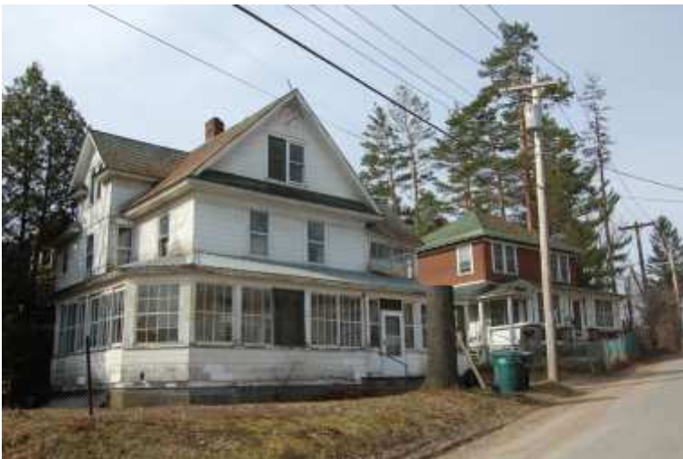
Name of Property: Helen Hill District City or Vicinity: Saranac Lake County: Essex and Franklin State: NY Date Photographed: 4/25/2014 Description of Photograph(s) and number: Helen Street at intersection of Franklin Avenue, facing southwest. L-R #72, 68. (Map IDs 06, 07) 2 of 21