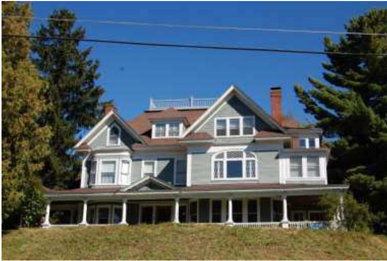
Name of Property: Helen Hill District City or Vicinity: Saranac Lake County: Essex and Franklin State: NY Date Photographed: 9/19/2013 Description of Photograph(s) and number: 8 Franklin Avenue, facing east. (Map ID 49) 19 of 21