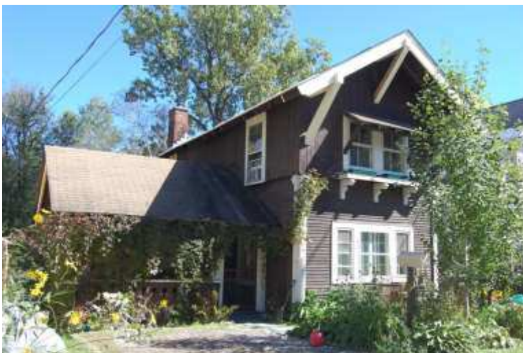
Name of Property: Helen Hill District City or Vicinity: Saranac Lake County: Essex and Franklin State: NY Date Photographed: 9/19/2013 Description of Photograph(s) and number: 84 Franklin Avenue, facing southeast. (Map ID 62) 21 of 21