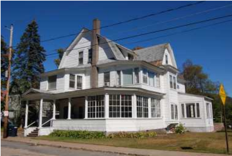
Name of Property: Helen Hill District City or Vicinity: Saranac Lake County: Essex and Franklin State: NY Date Photographed: 9/19/2013 Description of Photograph(s) and number: 100 Franklin Avenue, facing northeast. (Map ID 66) 13 of 21