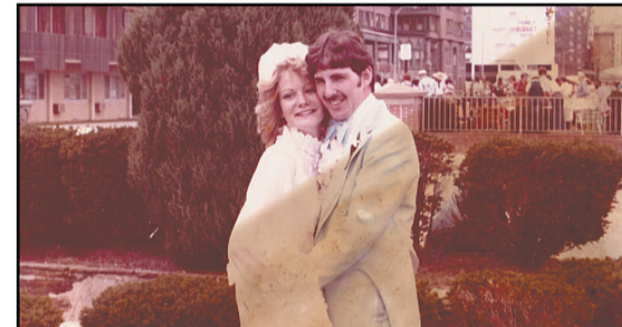
JUNE 25, 1977

You've always been the one I counted on, through joy, sorrow, laughter and tears, you keep me grounded; you're my steady rock! Sometimes I wonder what I ever did to deserve you. My passion for you cannot be denied. Together we are satisfied and blessed, our marriage is the very, very best!