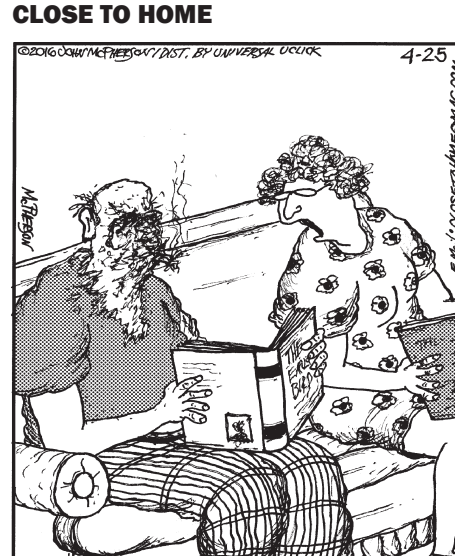
'To help you quit smoking, I've put one exploding cigarette in each pack.'