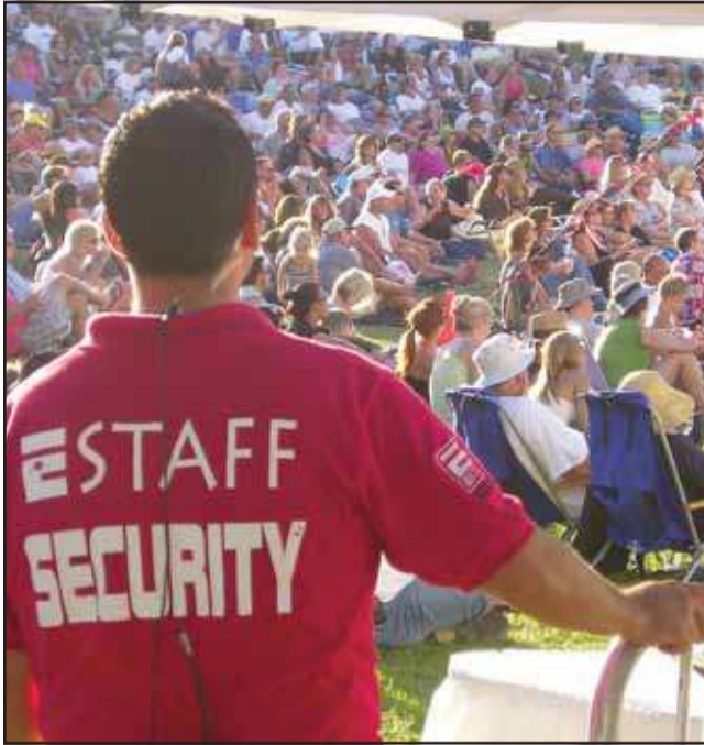
Estaff personnel on the job at an event.