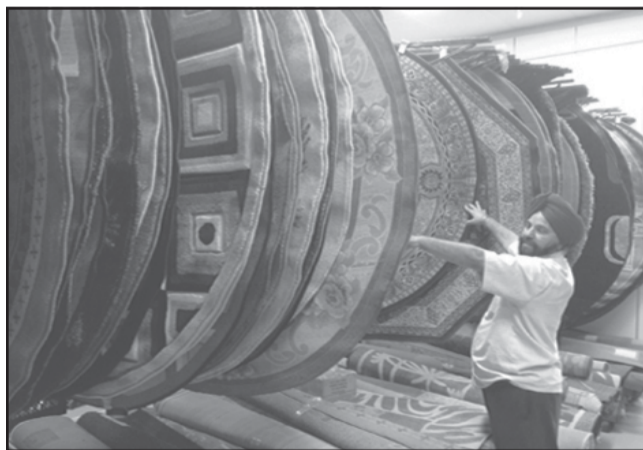
S.S. Sodhi Area Rugs 43rd Ave Thunderbird Marketplace

Looking to find out more about this AWESOME Business Opportunity? Get in Touch! Call 602-373-4827 or go to www.tbird43.com .