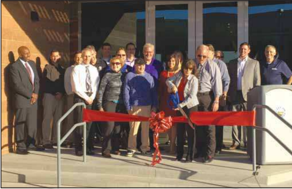
City of Peoria Mayor Cathy Carlat cuts the ribbon at the Grand Opening event for the new Colonnade VIP Event Room at the Peoria Sports Complex.

The Colonnade room is available to rent to any businesses or Peoria residents needing a facility for a special event or business function.