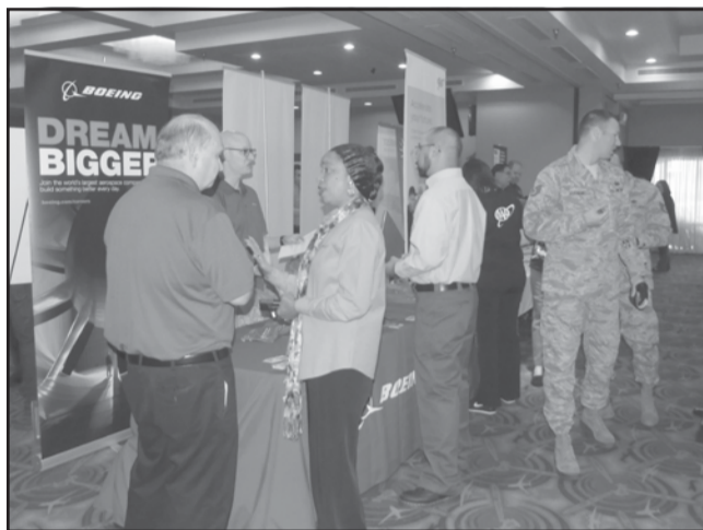
Veteran's finding jobs at Luke AFB Career Fair 2015

The Airman & Family Readiness Center at Luke Air Force Base offers workshops and other programs for military, DoD Civilians, and their families.