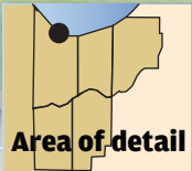
Area of detail

Phase 1 plans call for landscaping and other aesthetic upgrades on the entire site and an “eco-designed world class golf course.”