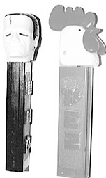
PEZ Dispensers 1940s thru 1970s