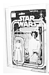
Star Wars Toys 1977-1989