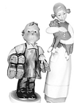
Buying Hummel and Lladro figurines

We are looking for Disneyland and Disney World park related items from 1955 to present. Including park used props, ride vehicles, also cast member costumes. Employee special exclusives and toys. Many ex-employees and friends have special keepsakes that they acquired when the park discarded or threw items away or sold them at special sales, and we would love to see them. Especially Disneyland silk screened posters and signs from the 50s and 60s. Vintage Disneyland ticket books and tickets and all kinds of souvenirs.