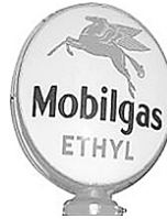
Buying all Gas & Oil advertising items 1960s and older