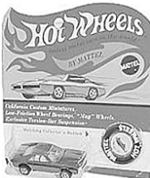
Hot Wheels 1960s thru 1970s

If you have something odd or unusual but not necessarily a toy, bring it anyway. We may be interested if it is old. Also buying BB Guns .