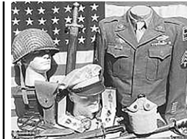
Buying all Vintage Military items