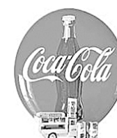
Soda, Ice Cream, Beer, Tobacco, etc. advertising items, 1960s and older