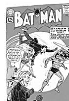
Super Hero Comic books 1930s thru 1960s