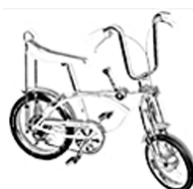
Buying Schwinn Krate Bikes

AMERICA'S TOY SCOUT PILOT EPISODE NOW IN PRODUCTION. COMING SOON ON TV