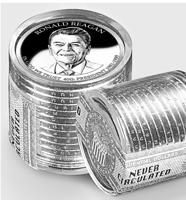
■ VALUABLE: These are the never before seen sealed Vault Tubes loaded with twelve valuable first-ever U.S. Gov't issued Ronald Reagan Dollar Coins in brilliant, never-circulated condition.