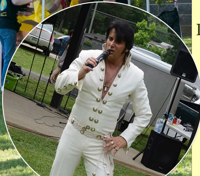
Elvis & More