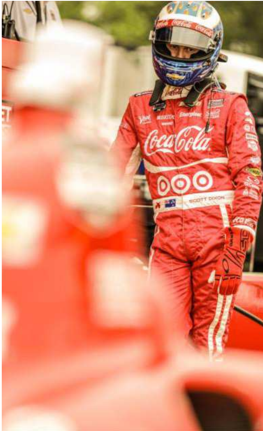
Scott Dixon , driver of the No. 9 Chevrolet sponsored by Target, clocked the fastest lap time at Barber Motorsports Park during a one-day trial run in March. Dixon's time was 1 minute 7.16 seconds around the 2.38-mile road course.