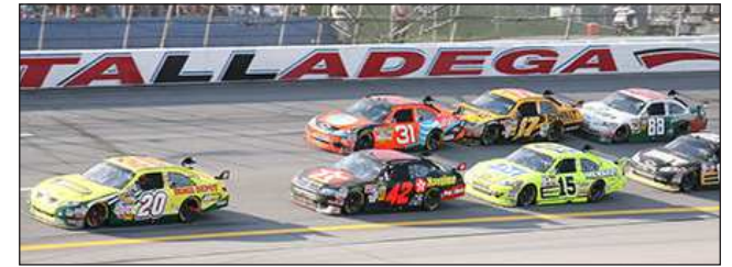
Tony Stewart leads the pack at Talladega in the fall of 2008, where he would notch his first and lone NASCAR Sprint Cup Series victory at the biggest and baddest track on the planet.

Since that triumph, however, the driver of the No. 14 Stewart-Haas Racing Chevrolet has struggled with only two