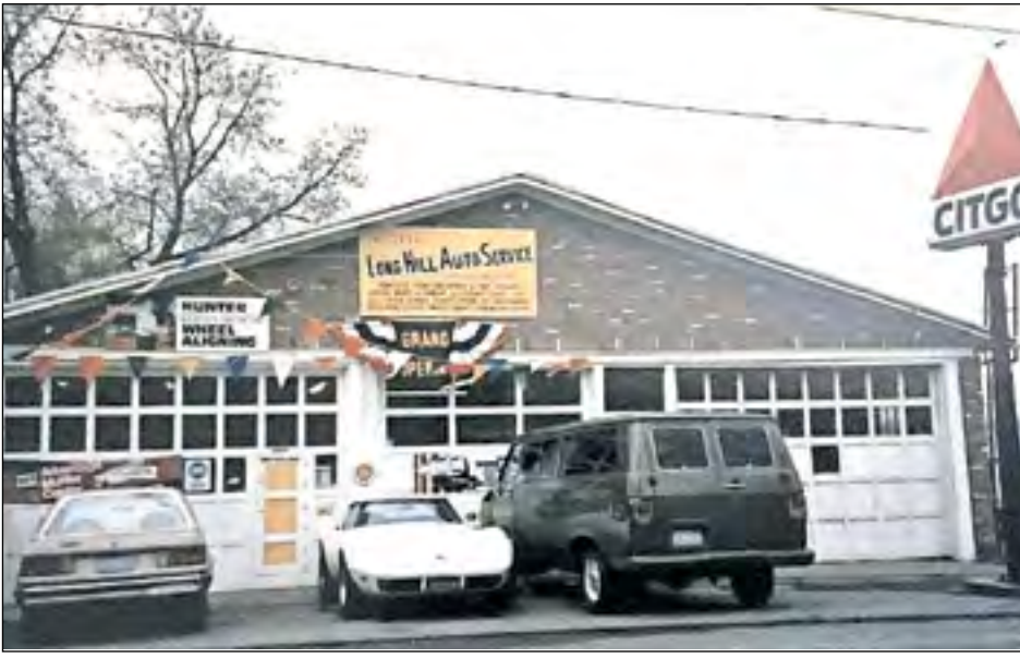
Long Hill Auto is shown during its 1986 grand opening in Millington.