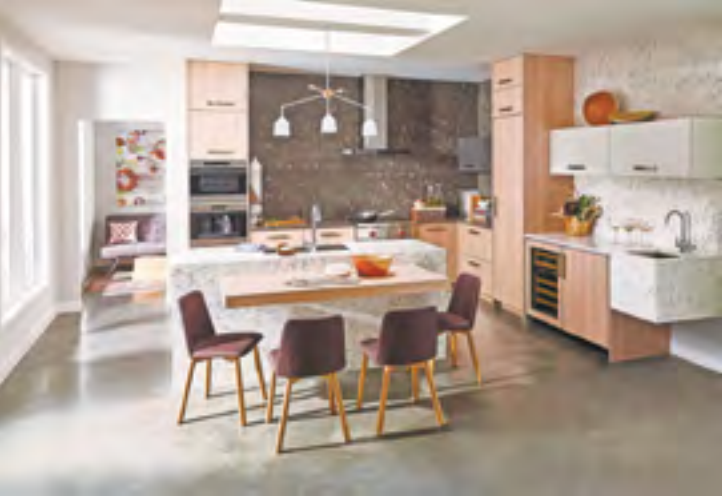
Mix and layer materials used for surfaces at home to create dramatic, beautiful spaces - this kitchen features High Pressure Laminate on tabletop and cabinets, as well as Solid Surface and Quartz on countertops, island and backsplashes.

The most immediate effect of mixing materials is that it opens new possibilities and new ways of expression. An example of this can be likened to how hard stone surfaces in a room can be complemented by soft carpet and furniture, or how the highly textured wood on a ceiling can stand in stark contrast to polished stone. Some of the hottest looks today, such as the blending of unfinished industrial materials with modern floors and cabinets, would have been considered outlandish only a few years