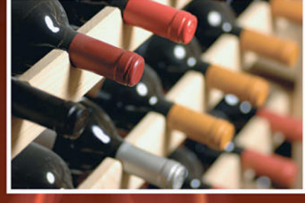
BEER & WINE A Great Selection of Beer & Wine to Compliment Our Food Items

MEATS Full Line of Packaged & Custom-Cut Meats