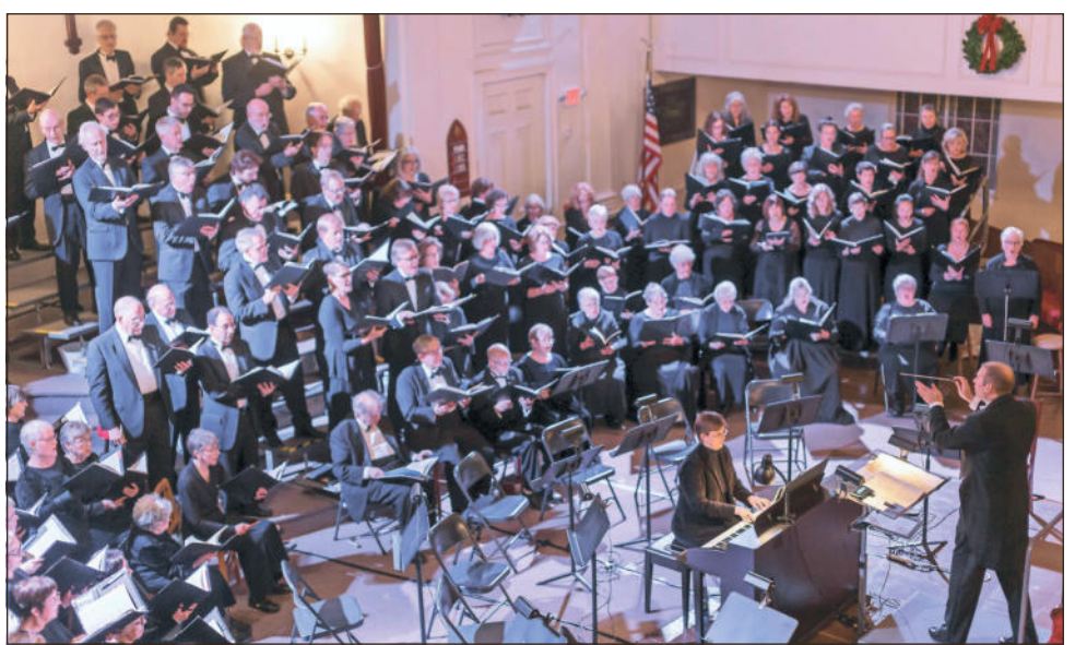
The Newburyport Choral Society had to cancel its 2020 performances due to the pandemic but is planning to present a winter concert this year.