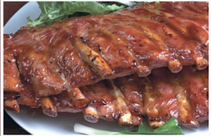
FAMOUS MARINADES Sirloin Tips | Boneless Chicken Boneless Pork | Wings & Thighs

MEATS Full Line of Packaged & Custom-Cut Meats