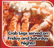
Crab Legs served on Friday and Saturday Nights!

$5 OFF 2 ADULTS OR MORE WITH 2 BEVERAGE PURCHASES Dine-in Buffet only - Not with any other offers - Expires 11/30/16