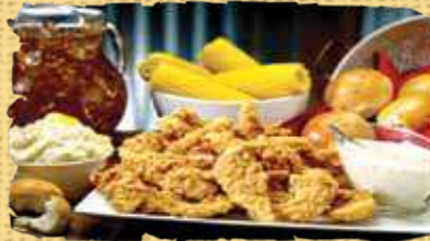
OUR FAMOUS Family Meals