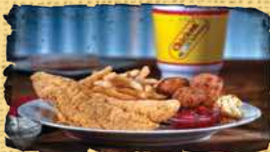
MOUTH WATERING Fried Fish Fillets