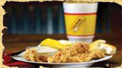
MOUTH WATERING Combo Meals

Providing fast, friendly service of the best quality food! Home of the legendary Express Tenders© and Chicken E© Sweet Tea!!