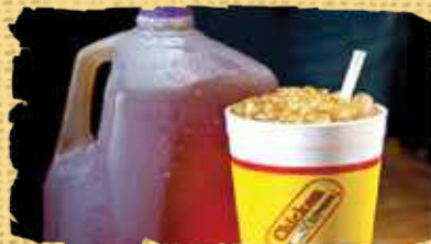
ICE COLD Drinks & Tea

Our Chicken is always fresh and you can taste the difference.