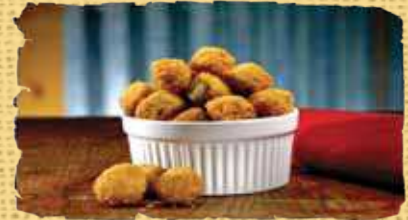
WIDE VARIETY OF Sides & Extras