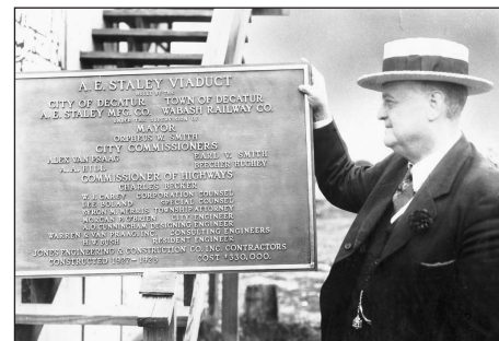
The Staley Viaduct, costing $330,000 to build, opened to traffic in 1928.

RELATED GALLERY: www.herald-review.com/gallery