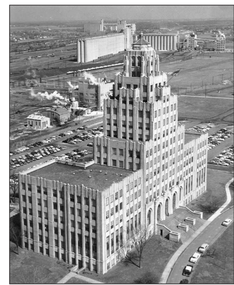
A.E. Staley Sr.'s private offices were on the eighth floor of the Administration Building completed in 1930.