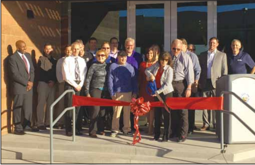
City of Peoria Mayor Cathy Carlat cuts the ribbon at the Grand Opening event for the new Colonnade VIP Event Room at the Peoria Sports Complex.

The Colonnade room is available to rent to any businesses or Peoria residents needing a facility for a special event or business function.