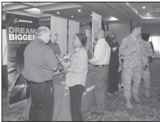
Veteran's finding jobs at Luke AFB Career Fair 2015

The Airman & Family Readiness Center at Luke Air Force Base offers workshops and other programs for military, DoD Civilians, and their families.