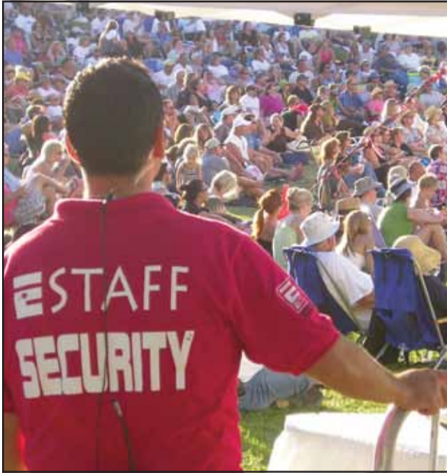
Estaff personnel on the job at an event.