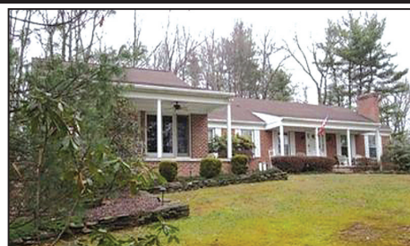
725 YELLOW HILL ROAD, BIGLERVILLE, PA 17307

46.89 Acres, 5 Bed, 5 Baths, Eat-In Kitchen, Dining Room, Living Room & Family Room w/Fireplace, 4+ Oversized Garage, Well/Septic, Upper Adams School District. $849,900 MLS#21404165