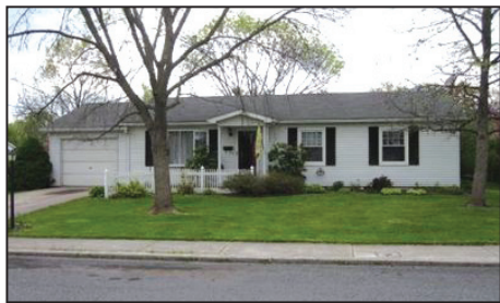
131 ARTILLERY DRIVE, GETTYSBURG, PA 17325

3 Bed, 1 Bath, Kitchen, Dining Room, Living Room, Deck, 1-Car Garage, Public Water/Sewer, Gettysburg Area School District. $126,900 MLS#21405004