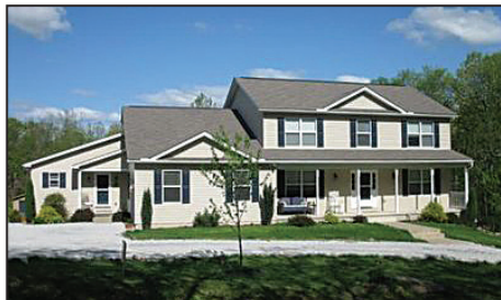
701 MCGLAUGHLIN RD., FAIRFIELD, PA 17320

1.03 Acres, 6 Bed, 4 Full Baths, 2 Half Baths, Eat-In Kitchen, Dining Room, Living Room, Family Room, Den, Sep. Guest or Residential Quarters, Attached Garage, Well/Septic, Fairfield Area School District. $359,900 MLS#21403814