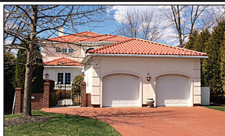
800 BURNSIDE DR., GETTYSBURG, PA 17325

Exceptional custom Mediterranean style home in Lake Heritage. Entertain in style on the lake front patio complete with fireplace and grill or on the covered deck and balcony with water views. Inside you'll discover magnificent workmanship and amenities throughout this 4300 sq. ft. 4 bdrm 4 1/2 bath beauty. Court yard offers a peaceful retreat. Attention to detail is apparent throughout. $720,000 MLS#21312009