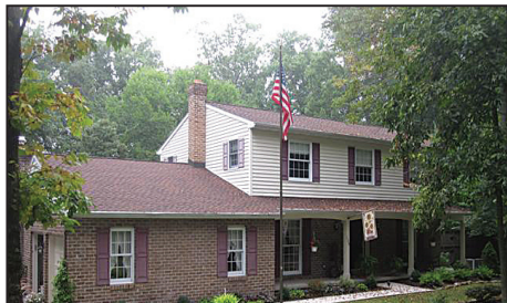
120 RIDGEWOOD DRIVE, GETTYSBURG, PA 17325

Colonial, 1.5 Acres, 4 Bed, 2 1/2 Baths, Kitchen, Dining Room, Family Room w/Fireplace, Den, 2-Car Attached Garage, Well/Septic, Gettysburg Area School District. $339,900 MLS#21402799