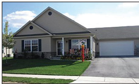
8 WILLOUGHBY LANE, GETTYSBURG, PA 17325

Contemporary, 2 Bed, 2 Baths, Kitchen, Dining Room, Family Room w/Fireplace, 2-Car Garage, Public Water/Sewer, Gettysburg Area School District. $195,900 MLS#21311410