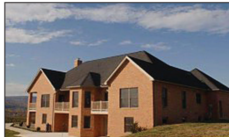
100 ORCHARD HILL DRIVE, ORRTANNA, PA 17353

Contemporary, 8.1 Acres, 4 Bed, 4 Baths, 1 Half Bath, Kitchen, Dining Room, Living Room, 1-Car Attached Garage, Well/Septic, Fairfield Area School District. $650,000 MLS#21400417