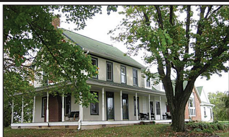
1059 BELMONT ROAD, GETTYSBURG, PA 17325

Beautiful turn of the century farm house with wrap around porch and long tree lined driveway on 58+ acres of pastoral land in Adams County. This home features all the modern conveniences of today with a gourmet kitchen and great room addition. 5 bedrooms, 3 1/2 baths, 2 car garage and an in-ground pool. Original barn and outbuildings included. $690,000 MLS#21402193