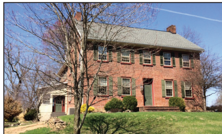
486 BEAVER CREEK ROAD, EAST BERLIN, PA 17316

Colonial Style Farm House, 8.43 Acres, 4 Bed, 1 Full, 1 Half Bath, Kitchen, Dining Room, Living Room, Family Room w/Fireplace, 2-Car Detached Garage, Well/Septic, Spring Grove Area School District. $399,900 MLS#21402134