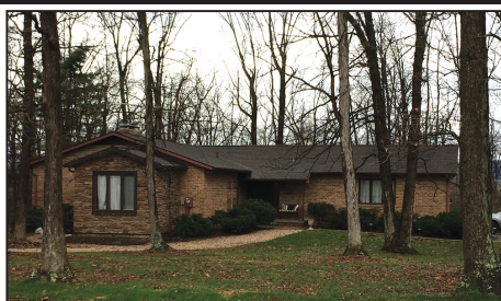
1060 BELMONT ROAD, GETTYSBURG, PA 17325

Private residence plus 2 charming income-producing guest cottages on 15+ acres. This brick rancher offers large bright rooms, 3 bedrooms & 3 baths, fireplace, garage and decks to enjoy the peaceful wooded setting. Each cottage is fully equipped and offers clear views of the mountains while overlooking the pastoral countryside. $695,000 MLS#21310609