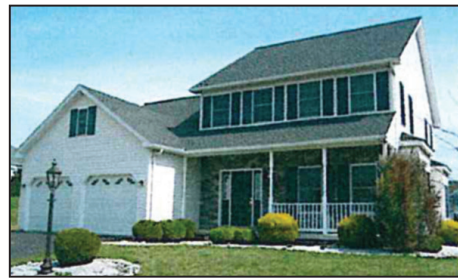
36 SABRE CIRCLE, GETTYSBURG, PA 17325

.29 Acre, 4 Bed, 2 1/2 Baths, Kitchen, Dining Room, Living Room, Family Room w/Gas Fireplace, 2-Car Attached Garage, Public Water/Sewer, Gettysburg Area School District. $289,900 MLS#21310034