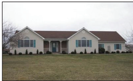
14 MISTY LANE, BIGLERVILLE, PA 17307

1.32 Acres, 3 Bed, 2 Baths, Eat-In Kitchen, Separate Dining Room, Living Room, Family Room, 2-Car Oversized Garage, Well, Public Sewer, Gettysburg Area School District. $269,900 MLS#21403512