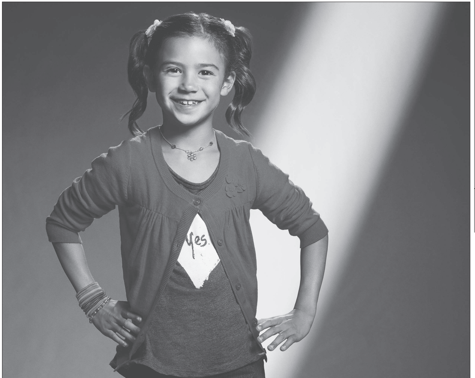
Scarlett Estevez as seen in "Lucifer"