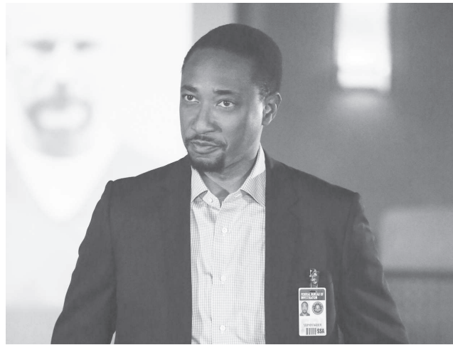
Damon Gupton in "Criminal Minds"