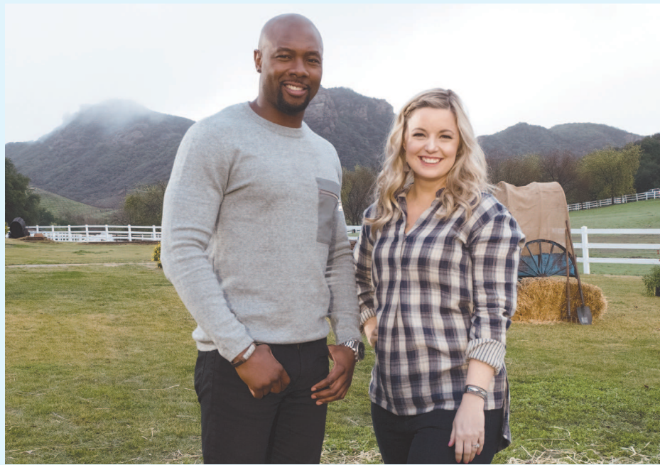
Eddie Jackson and Damaris Phillips as seen in "Kids BBQ Championship"