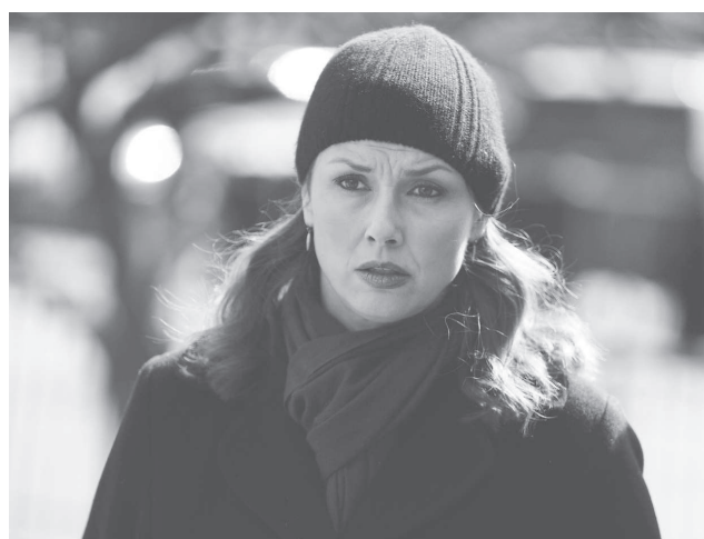
Bridget Moynahan in "Blue Bloods"

In this new episode, entrepreneurs discover that starting a business means you need not only a good idea, but also a problem that needs solving. The participants test-drive their ideas on one of the world's toughest audiences: New Yorkers.