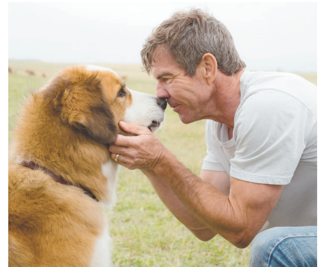
A scene from "A Dog's Purpose"