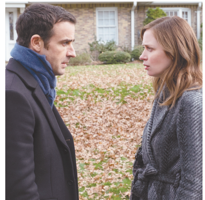
Justin Theroux and Emily Blunt star in "The Girl on the Train"

David (Paul) and Claire (Wallis) are deeply in love with each other — or so David thinks. When Claire goes missing without leaving any trace, David begins obsessively trying to find out where she went, eventually uncovering clues that suggest the life that she had been living with him had been a sham. He finds out that she had a whole other life that she kept hidden. The truth shocks him as he digs deeper. Director: Zack Whedon. Stars: Annabelle Wallis, Aaron Paul, Garret Dillahunt, Zachary Knighton. 2016. 112 min. Drama.