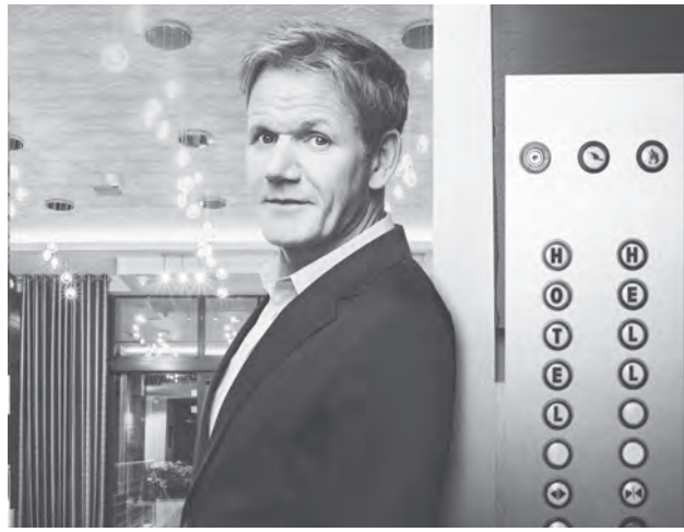
Chef Gordon Ramsay hosts "Hotel Hell"