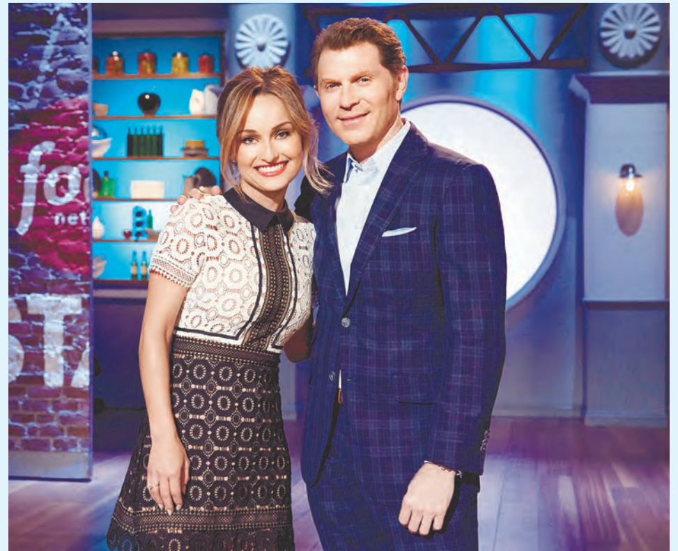
Giada De Laurentiis and Bobby Flay host "Food Network Star"

This season, the traditional 12 potential stars are becoming 13 — a baker's dozen. That