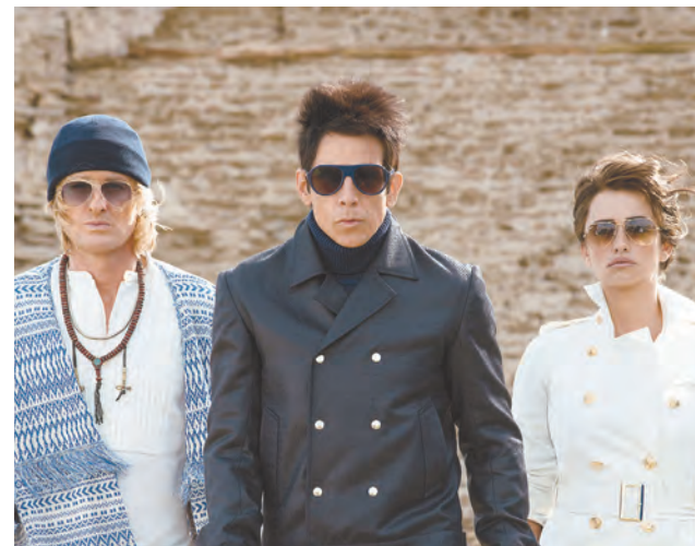
Owen Wilson, Ben Stiller and Penélope Cruz star in "Zoolander 2"