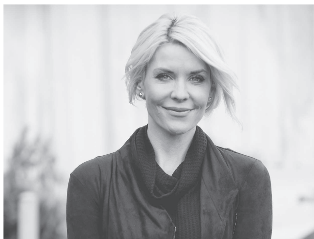
McKenzie Westmore hosts "Face Off"

Liv (Rose McIver), Clive (Malcolm Goodwin) and Ravi (Rahul Kohli) suspect foul play may have been involved in a fatal car accident in this new episode. The accident victims were a well-meaning father and his angst-ridden teenage daughter.