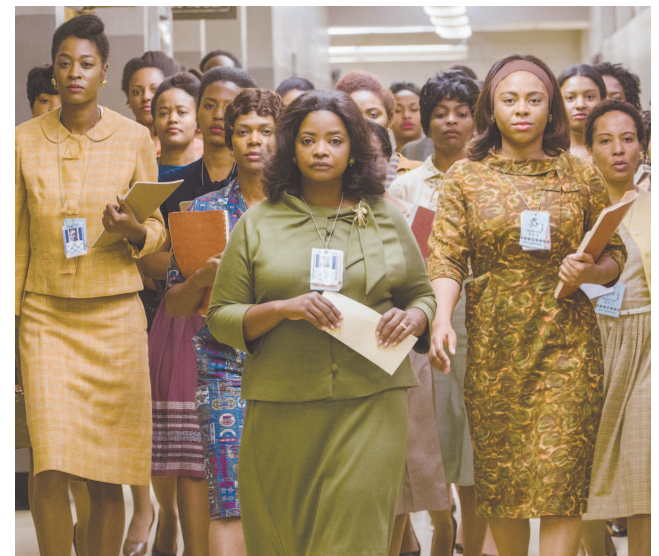
A scene from "Hidden Figures"

Director: Maren Ade. Stars: Sandra Huller, Peter Simonischek, Michael Wittenborn, Thomas Liobl. 2016. 162 min. Comedy.