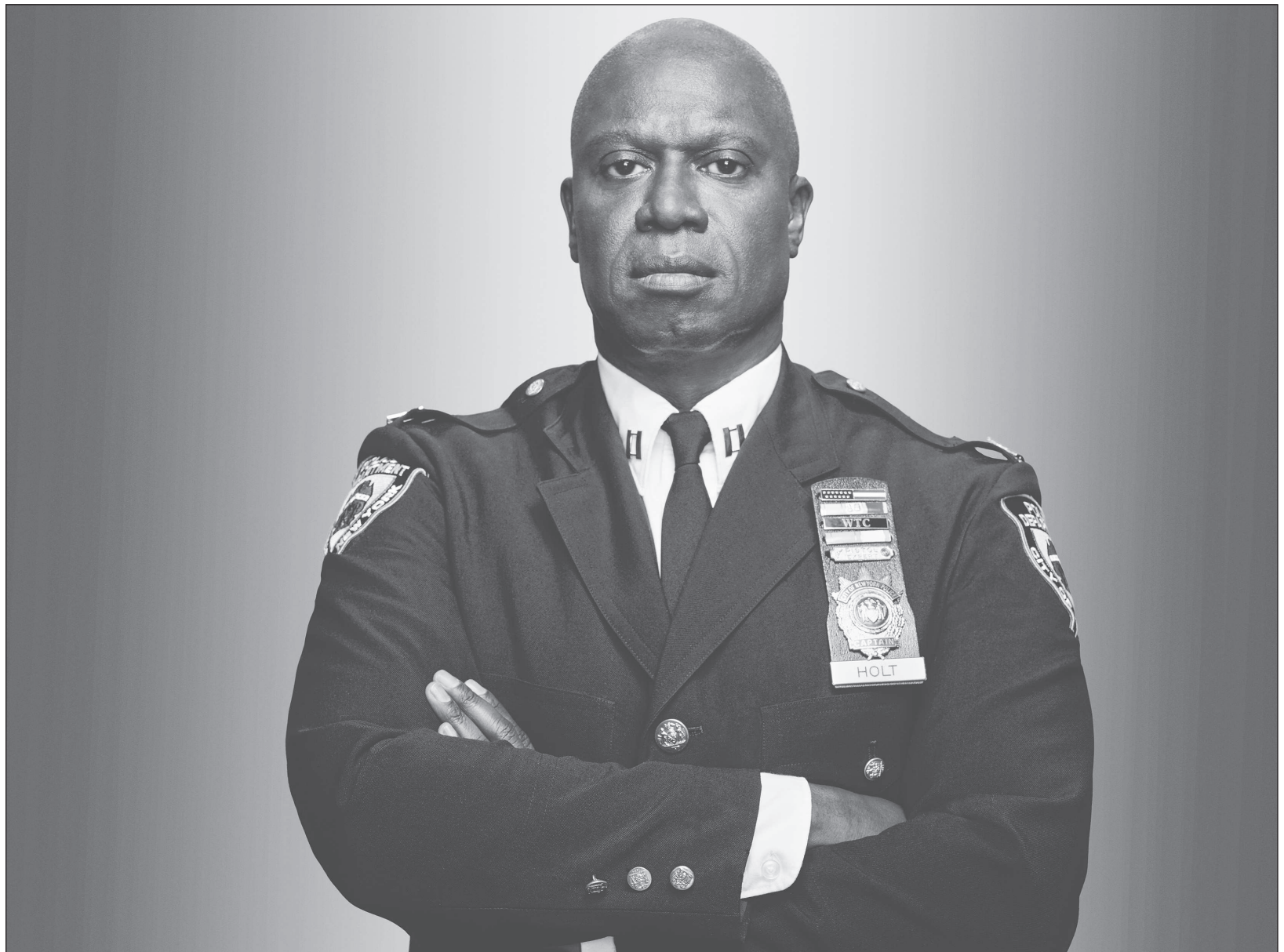
Andre Braugher as seen in "Brooklyn Nine-Nine"

In a real-life plot twist, Peretti revealed earlier this year (though well after the bus episode aired) that she's pregnant, and many fans speculate that her pending maternity leave is the driving force behind her character's bus-related trauma. Getting ready to step into first-time parenthood is no small thing, and Peretti and her husband, comedian and filmmaker Jordan Peele ("Key & Peele"), have been receiving a lot of good will from "Brooklyn Nine-Nine" fans. We're all hoping that Gina will recuperate and return to the Nine-Nine in all her fabulous glory, but even if she doesn't, the rich tapestry of