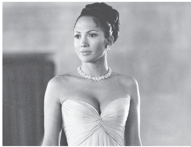
Jennifer Lopez stars in "Maid in Manhattan"

Jennifer Lopez stars as Marisa Ventura, a hotel maid who is mistaken for a fellow guest by the handsome heir to a political dynasty (Ralph Fiennes). When her true identity is eventually revealed, the two lovers discover that they are worlds apart.