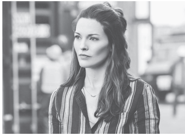
Alana De La Garza stars in "Criminal Minds: Beyond Borders"

When a woman is murdered while on a yoga retreat in Nepal, the IRT searches for the killer in this new episode. The case marks Monty's (Tyler James Williams) first international mission with the team. Charisma Carpenter guest stars.