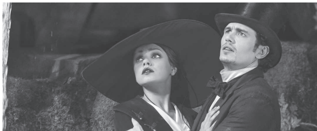
Mila Kunis and James Franco in "Oz the Great and Powerful"