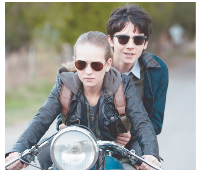
Britt Robertson and Asa Butterfield as seen in "The Space Between Us"

After a team of operatives led by Xiang (Yen) steals a device capable of weaponizing orbiting satellites, operative Xander Cage (Diesel), who faked his own death in the previous installment of this franchise, springs back into action to recover it. After paying a visit to his old friend Ainsley (Corfield) for a helping hand, he traces Xiang and the device to the Philippines. But when he and his old team stage a raid to recover the device, Xander discovers that there are far more layers to this conspiracy than he originally thought. Director: D.J. Caruso. Stars: Vin Diesel, Donnie Yen, Hermione Corfield, Samuel L. Jackson, Deepika Padukone, Kris Wu. 2017. 107 min.