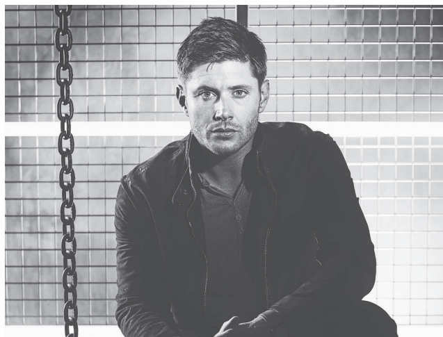
Jensen Ackles stars in "Supernatural"

Sam (Jared Padalecki) and Dean (Jensen Ackles) must rely entirely on each other when they're caught in a dangerous situation in this new episode. Elsewhere, the conflict between the American Hunters and the British Hunters reaches a critical point.