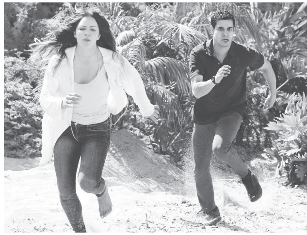
Katharine McPhee and Elyes Gabel in "Scorpion"

When Don's (Kevin Nealon) newborn grandson comes to visit, Adam (Matt LeBlanc) and Andi (Liza Snyder) consider having another baby in this season finale. A contractor stays home with the kids when his wife goes back to work in this comedy.