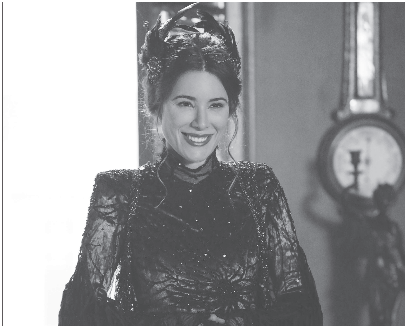
Jaime Murray as seen in "Once Upon a Time"

Season 6 is an end in more ways than one, as show creators Edward Kitsis and Adam Horow-