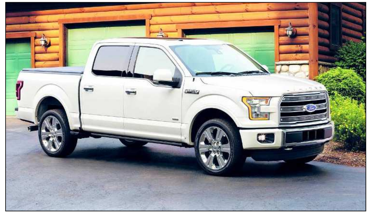
After an all-new design for 2015, the Ford F-150 gets even more updates for 2016 to keep it a sales leader.

To operate Pro Trailer Backup Assist, the customer rotates a knob to indicate how much the system should turn the trailer. The technology automatically steers the truck to turn the trailer the desired amount. The system may limit vehicle speed to enhance occu-