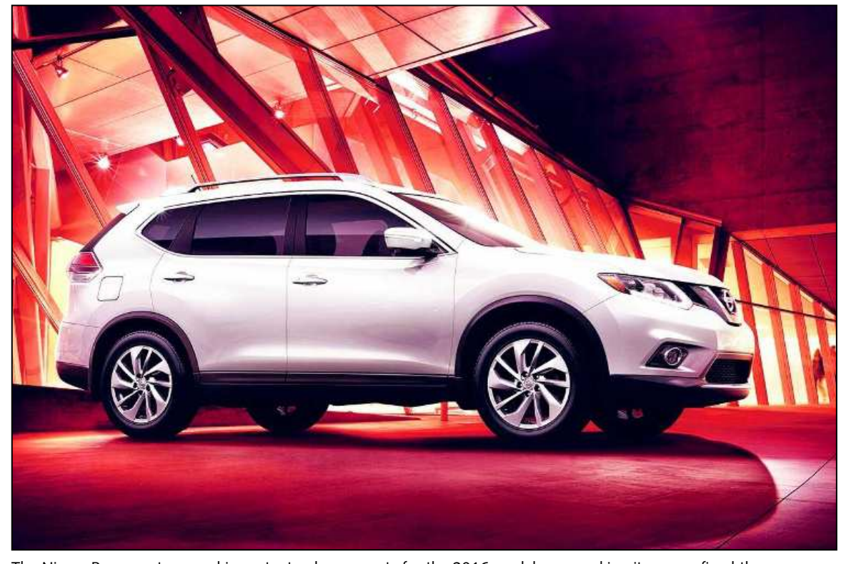
The Nissan Rogue gets several important enhancements for the 2016 model year, making it more refined than ever.