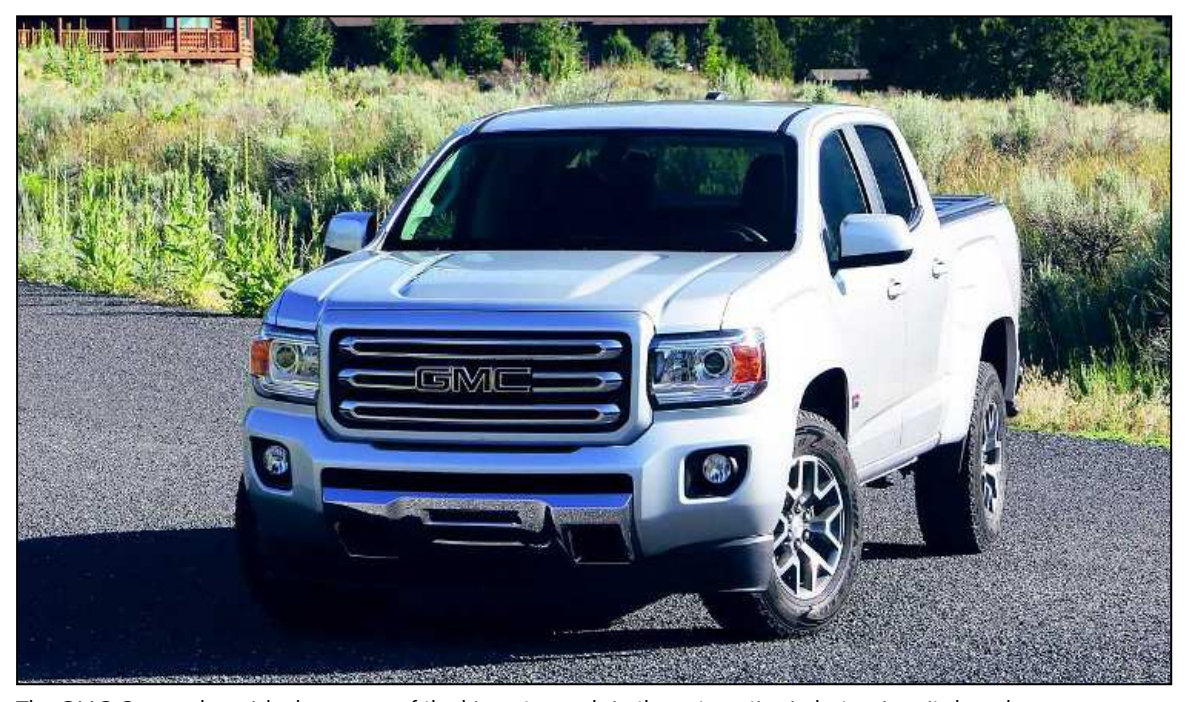
The GMC Canyon has picked up some of the biggest awards in the automotive industry since its launch.

Autoweek also honored Canyon as the "Best of the Best Truck for 2015," while Wards Auto World recognized the Canyon as one of Ward's 10 Best Interiors for