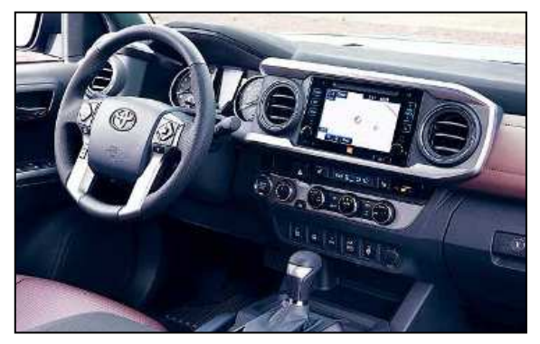
Soft-wrapped trim and metallic accents set the stage for a high-quality look and feel in the Tacoma's interior.

designed, developed and built for lifestyles of the young and young-atheart."