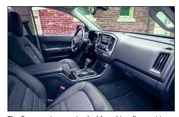
The Canyon set a new standard for cabin refinement in mid-size trucks when it was introduced last year.

2015, based on criteria such as design harmony, ergonomics, materials, driver information, safety and