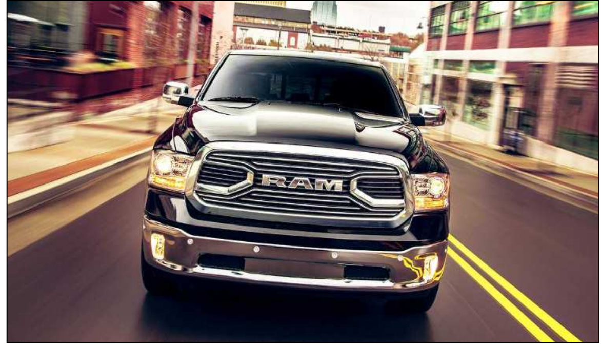
The Ram 1500 Laramie Limited gets a prominent new grille as part of its "black-tie" luxury appeal.

Ram Truck offers the best value in half-ton trucks with a starting price of $25,410, plus $1,195 destination, and includes a standard 5.7-liter HEMI V-8 engine. The exclusive 3.0-liter V-6 EcoDiesel engine with the TorqueFlite eight-speed automatic transmission is