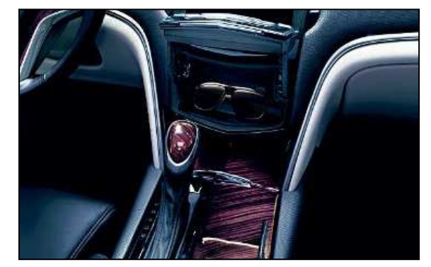
The XTS offers the latest in connectivity features in its bold, elegantly designed cabin.

incorporates cameras to provide a 360-degree overhead view around the XTS on the Cadillac CUE eight-inch-diagonal color display. It is part of the available Driver Awareness package, which also includes Lane Keep Assist, Side Blind Zone Alert, Rear Cross-Traffic Alert, Forward Collision Alert and Safety Alert Seat.