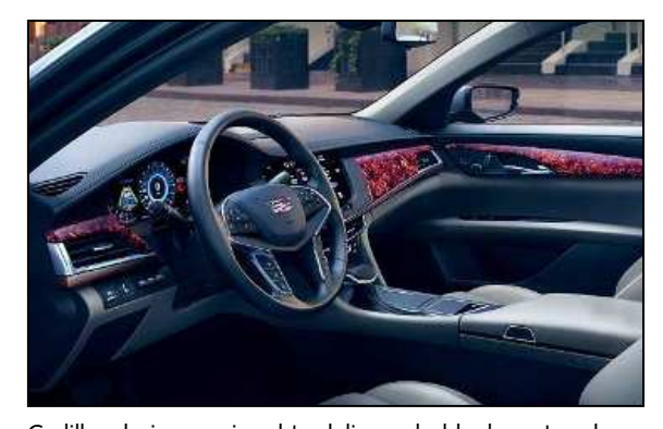
Cadillac designers aimed to deliver a bold, elegant and spacious interior in the CT6.

president of Cadillac. "It is a bold endeavor with unmatched dynamism that reignites a passion for driving in large luxury vehicles. In short, it is prestige luxury reimagined."