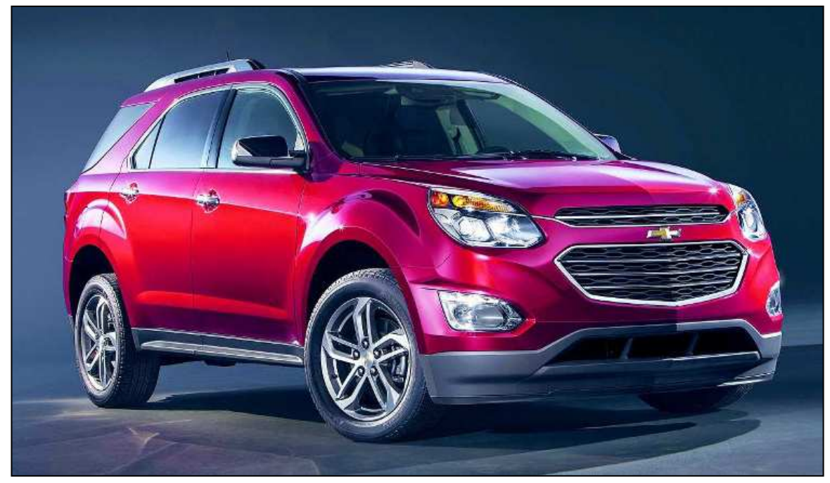
The Chevrolet Equinox has new styling, part of a long list of upgrades for the 2016 model year.

Equinox competes in the compact SUV segment, which surged 17.4 percent in 2014 and accounted for 15.5 percent of the total U.S. vehicle market – eclipsing midsize cars for the first time to become the auto industry's largest segment.