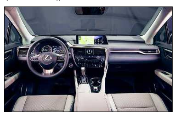
The interior of the new RX reflects an impeccable balance of functionality and opulence.