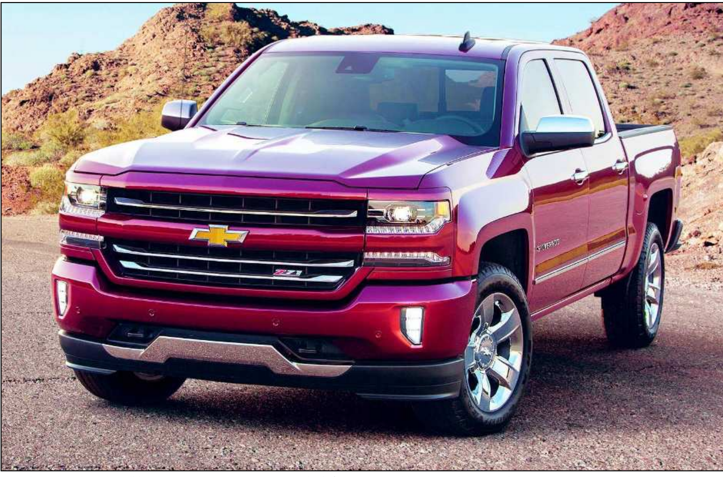
The Chevrolet Silverado will be getting a new, more aggressive look for 2016, in addition to other upgrades.

Since the introduction of the all-new Silverado 1500 in the spring of 2013,