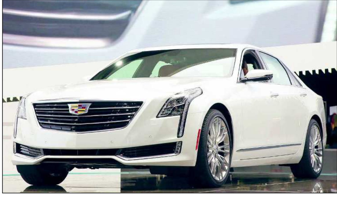
Cadillac adds the CT6 at the top of its lineup for 2016, creating a new level of American luxury and performance.

"The CT6 is nothing less than an entirely new approach to premium luxury – and an approach only Cadillac can offer," said Johan de Nysschen,