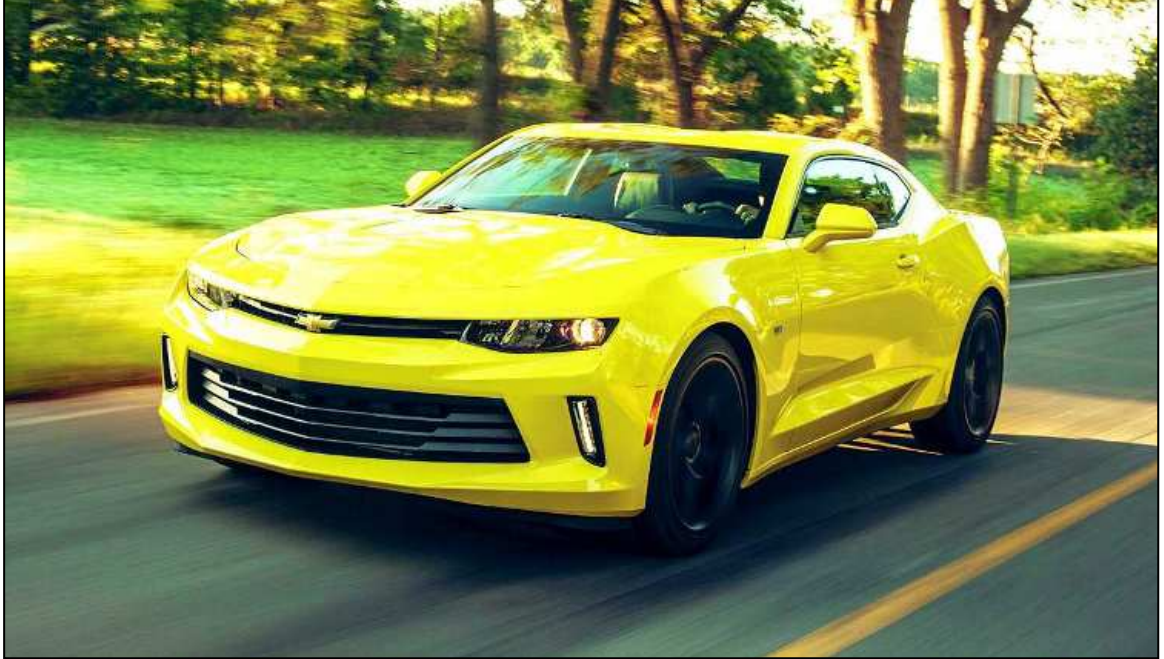
The new sixth-generation Chevrolet Camaro is faster, more nimble and more technologically advanced than ever.

Camaro's leaner, stiffer platform and slightly smaller