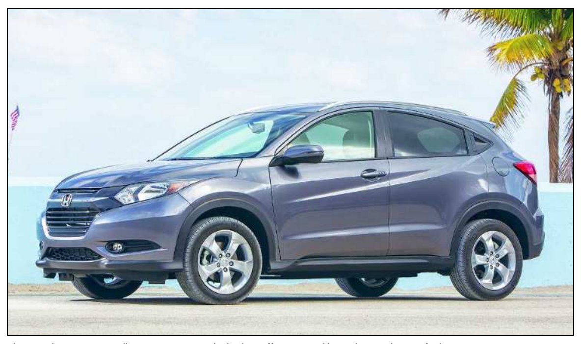
The Honda HR-V is an all-new crossover vehicle that offers coupe-like styling and great fuel economy.

Available in LX, EX and EX-L Navi trims, the 2016 HR-V is powered by a highly refined and efficient 1.8-liter 4-cylinder 16-valve