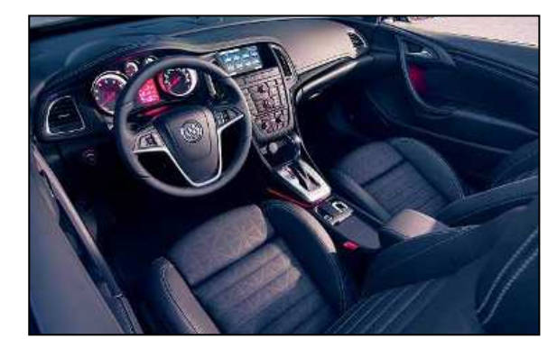
Inside, a thoughtfully trimmed and comprehensively equipped cabin reflects Buick's renaissance.

figuration offers comfortable room for four adults. Its expressive driving experience is rooted in a rigid body structure, Buick's sophisticated HiPer Strut front suspension and responsive Watts Z-link suspension in the rear – along with a 200-horse-power turbocharged engine.