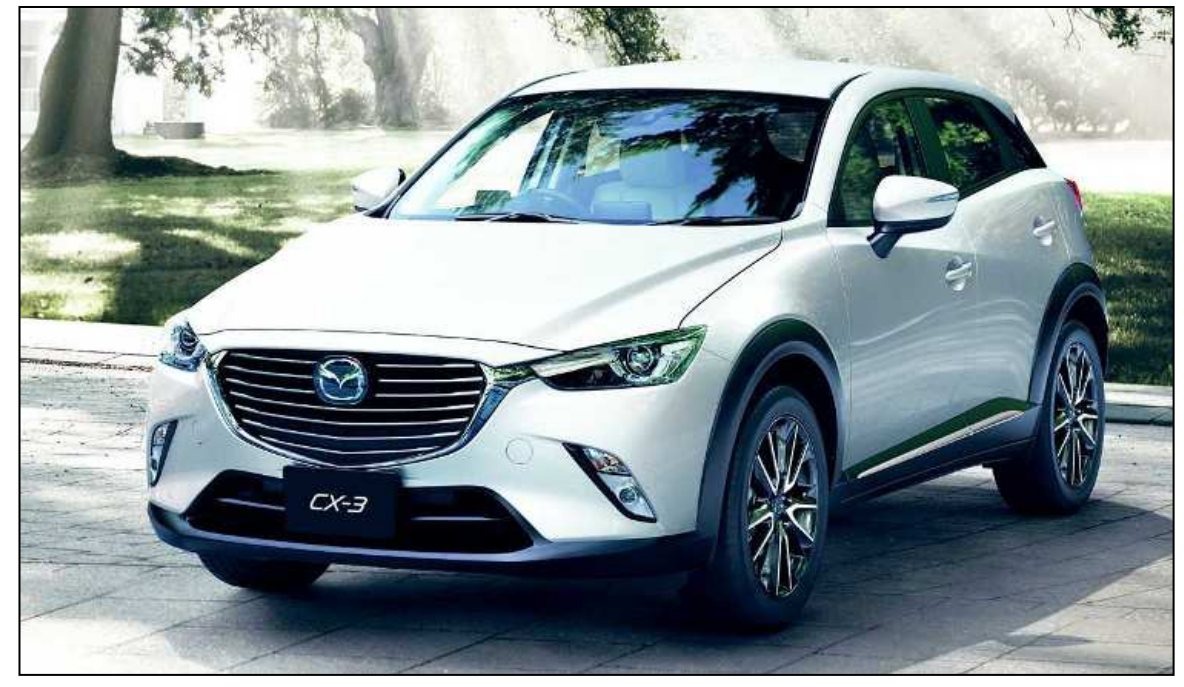
The all-new CX-3 uses the latest technology to get great efficiency and performance in a fun-to-drive crossover.

"The 2016 CX-3 is the next evolution of our mission to meld style, driving enjoyment and efficiency into a vehicle that demonstrates drivers don't need