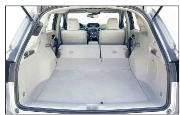
A power tailgate and heated front seats are among the standard luxury features added to the RDX.

Rearview Camera. The 2016 RDX with Technology Package receives numerous additional upgrades, including an 8-way power-operated front passenger seat (previously 4-way power), Acura's dual-screen On-Demand Multi-Information Display (ODMD), HD Radio Blind Spot Information (BSI), Rear Cross Traffic Monitor, and Multi-View rearview camera with dynamic guidelines.