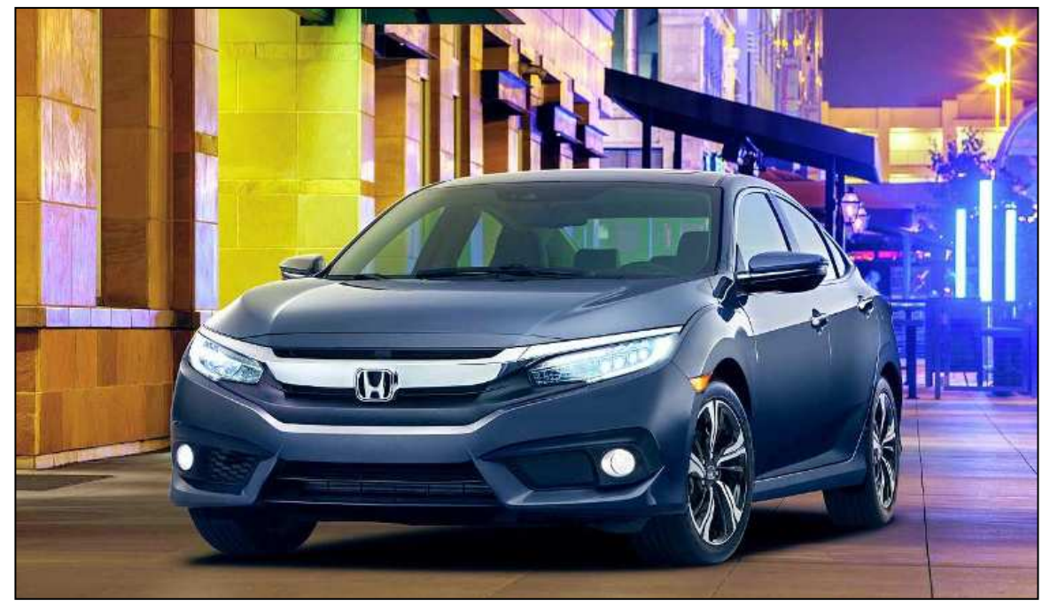
An aggressive new look is one of many changes for the Honda Civic, which gets a totally fresh design for 2016.

The Civic Sedan is the first in a series of new 10th-generation Civic models that will include a sedan, coupe, high-performance Si models, a 5-door hatchback and the first-ever Civic Type-R model for the U.S. market, compris-