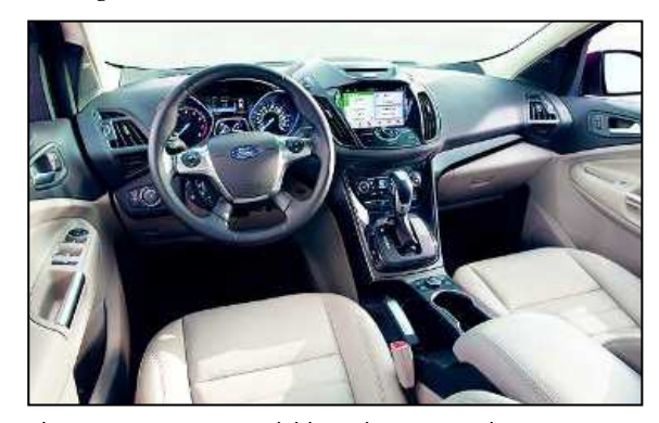
The 2016 Escape is available with SYNC 3, the new generation of Ford's advanced infotainment system.

chrome appearance package that includes elegant accents like chrome door handles, liftgate appliqué, side-mirror skullcaps, roof rails, rear license plate appliqué and chrome trim on the front fascia grilles; it also includes 19-inch wheels and leather-accented seats.