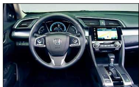
The 2016 Civic features Apple CarPlay and Android Auto to offer the latest smartphone connectivity.

ing the most diverse and innovative lineup in Civic's 43-year history.