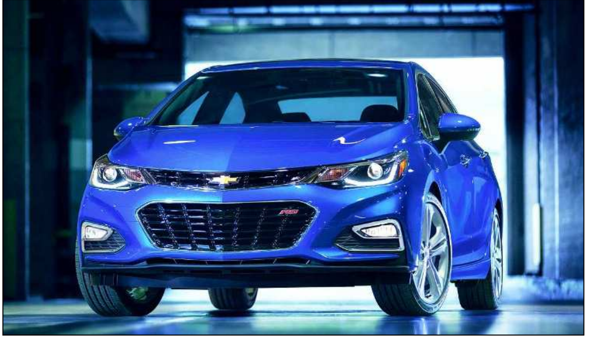
Chevrolet's best-selling car around the world gets a completely new design for the 2016 model year.

It will be offered in more than 40 global markets and goes on sale first in North America in early 2016. A new, standard 1.4L turbocharged engine with direct injection and an SAEcertified 153 horsepower