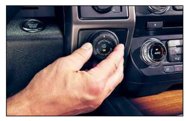
A new feature in the F-150 lets you steer a trailer by turning a knob left or right.

pant comfort over various road surfaces. The result is less time required to back up a trailer with improved confidence – it even helps towing experts by reducing time lost to maneuvering mistakes.