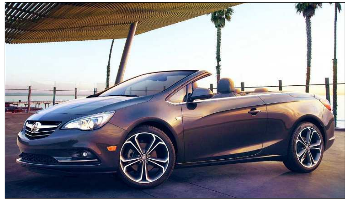
Designed from the ground up as a convertible, the all-new Buick Cascada has a gorgeous look.