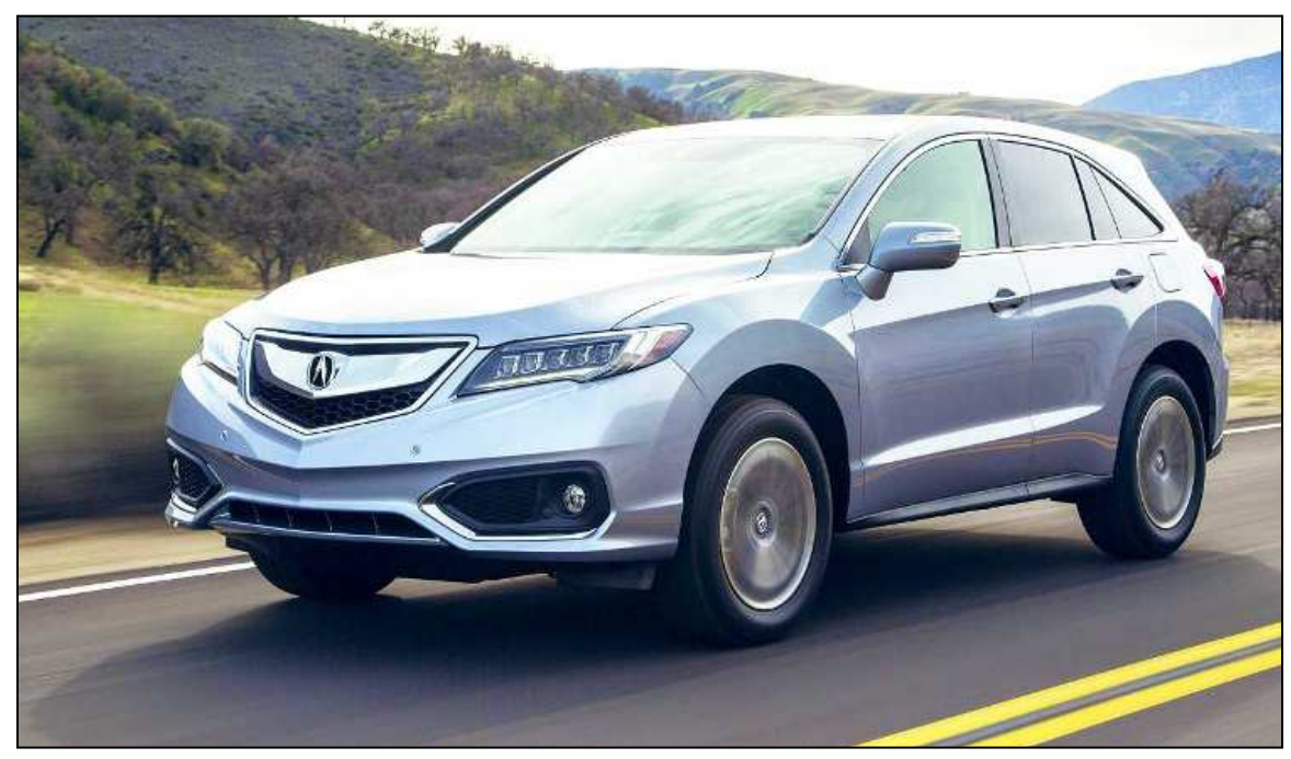
The Acura RDX has been freshened inside and out for 2016, offering a high level of luxury and style.

Inside, the 2016 RDX gets a freshened look with high-contrast silver and black trim plus significant upgrades to standard luxury features, including heated front seats, second-row air conditioning vents, a power tailgate and Multi-View