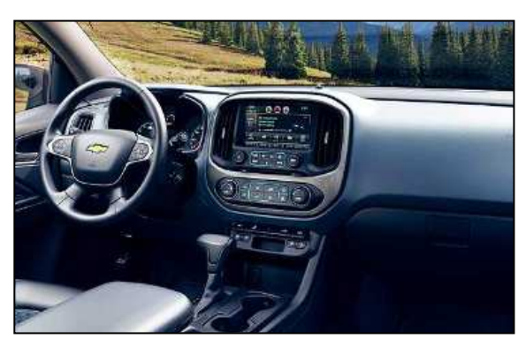
Technology in the Colorado includes Apple CarPlay that makes it easy to control smartphone features.

efficiency, while continuing to offer innovative features such as Chevy MyLink with a built-in available 4G LTE Wi-Fi hotspot, Lane Departure Warning and Forward Collision Alert. They complement true truck elements such as the available G80 locking rear axle and a highly flexible bed with Chevy's available GearOn system.