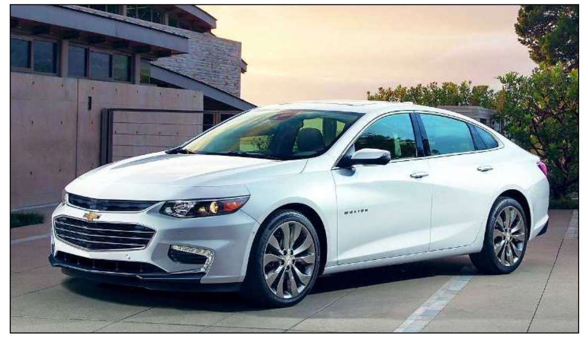
With a four-inch longer wheelbase, the all-new 2016 Chevy Malibu is longer, lighter and more efficient than before.

The 2016 Malibu is also longer and lighter, with more interior space and improved fuel efficiency. Its wheelbase has been stretched close to four inches, and it is nearly 300 pounds lighter than the