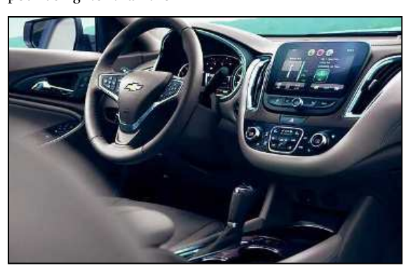
The new Malibu incorporates a host of fresh technologies, including Chevrolet's Teen Driver feature.