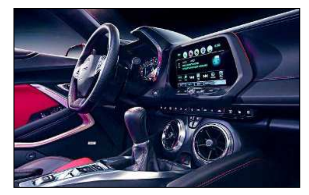
The new interior keeps classic Camaro design touches while adding new features and sophistication.

dimensions are accentuated by a dramatic, sculpted exterior. Meticulously tuned in the wind tunnel, the exterior contributes to performance through reduced aerodynamic lift for better handling while enhancing efficiency.