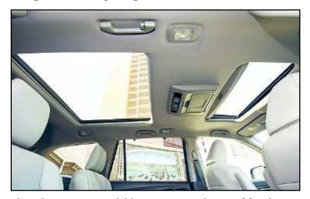
The Pilot gets an available panoramic glass roof for the first time ever as part of its 2016 redesign.

ing, safety performance, and dynamic handling performance in the midsize SUV segment. American consumers have responded by purchasing more than 1.4 million Pilots over the past 12 years. Pilot also ties the CR-V in having the highest brand loyalty of any Honda model, with approximately 63 percent of Pilot buyers returning to purchase another Honda vehicle.