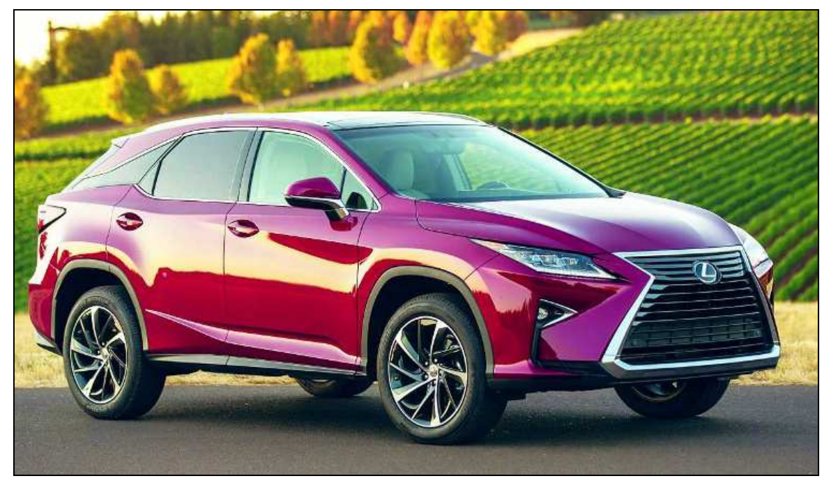
The all-new Lexus RX luxury crossover gets a bold spindle grille and sharp, angular design for 2016.

The all-new RX's mix of sharp creases and curves represents a bold evolution in the model's styling, sharing the same design DNA with other recently-launched models in the Lexus lineup. Moreover, this perennial best-selling luxury crossover features hybrid and gasoline powertrains, sophisticated safety features, driver aids and welcome new convenience and technology features to make this one of the best Lexus luxury utility vehicles offering to date.