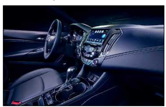
The Cruze's new cabin has more space, including more rear-seat knee room than the competition.

helps enable a General Motors-estimated 40 mpg on the highway with the available six-speed automatic transmission. Stop/ start technology helps enhance the Cruze's efficiency in stop-and-go driving.