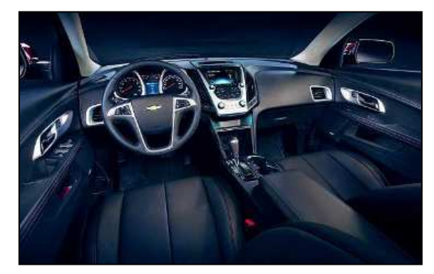
Equinox offers one of the quietest cabins in its segment thanks to its thoughtful, noise-absorbing design.

Equinox sales in the U.S. increased to 242,242 in 2014 – the fifth consecutive year of record sales since the second-generation launched as a 2010 model. Sales were up again 17 percent for the first quarter of 2015.