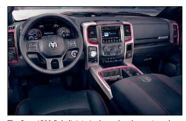
The Ram 1500 Rebel's interior has colored accents and a rugged, brawney cabin.

priced $3,120 greater than a similarly equipped Ram 1500 with a 5.7-liter HEMI V-8 engine with the TorqueFlite eight-speed transmission.