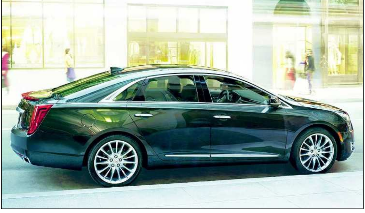
Surround Vision is one of many technological upgrades on the luxurious Cadillac XTS for the 2016 model year.