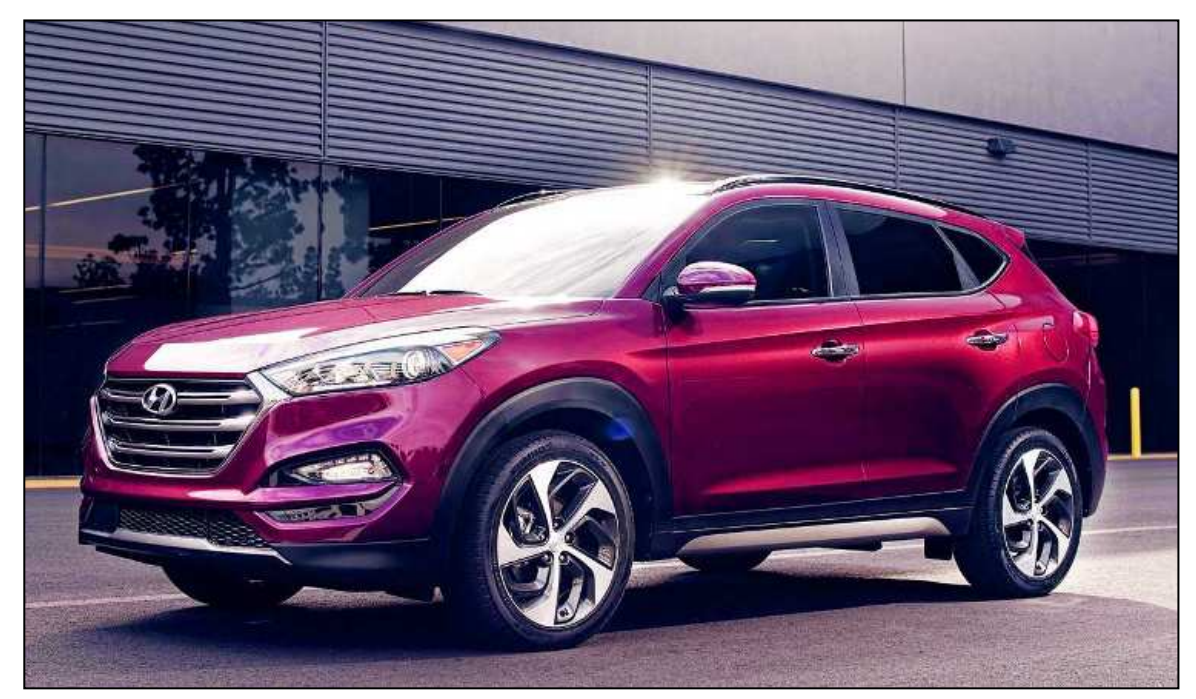
The Hyundai Tucson gets an all-new design for 2016 that sets a long list of firsts for its segment of the car industry.

The new Tucson gets a more premium feeling interior that adds an even greater sense of roominess for 2016.