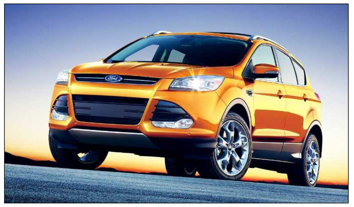
The 2016 Ford Escape, shown here in upscale Platinum trim, looks and drives like a modern, sophisticated car should.

Two new colors arrive for the 2016 Escape – Shadow Black and Electric Spice. Additionally, the SE series gets an available