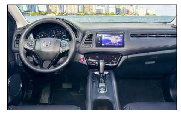
The HR-V offers a high level of standard equipment, along with available premium features.

DOHC i-VTEC engine producing a peak 141 horse-power and 127 lb.-ft. of torque. The engine is paired with one of two efficient and responsive Honda transmissions, a seamless and sporty continuously variable transmission (CVT), available on all models, or an engaging, short-shifting 6-speed manual transmission, available on LX and EX models with 2WD.