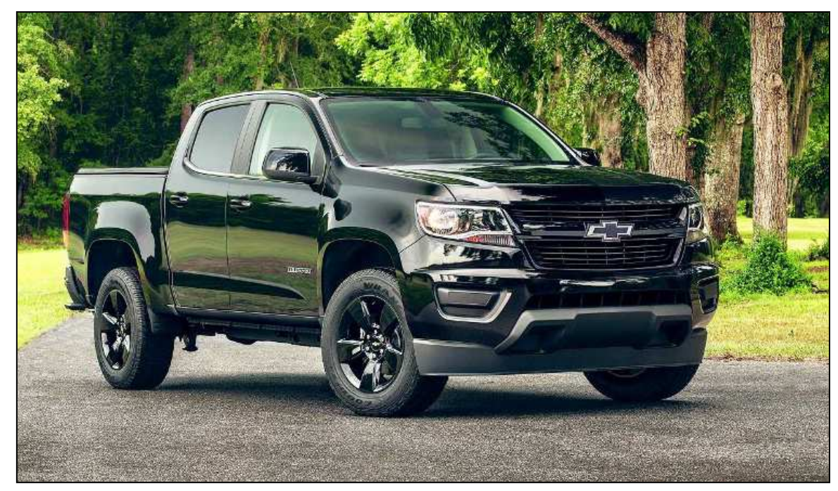
Motor Trend's 2015 Truck of the Year, the Chevrolet Colorado is setting a new standard for mid-size pickups.

For 2016, Colorado returns with the same award-winning combination of refinement, maneuverability and