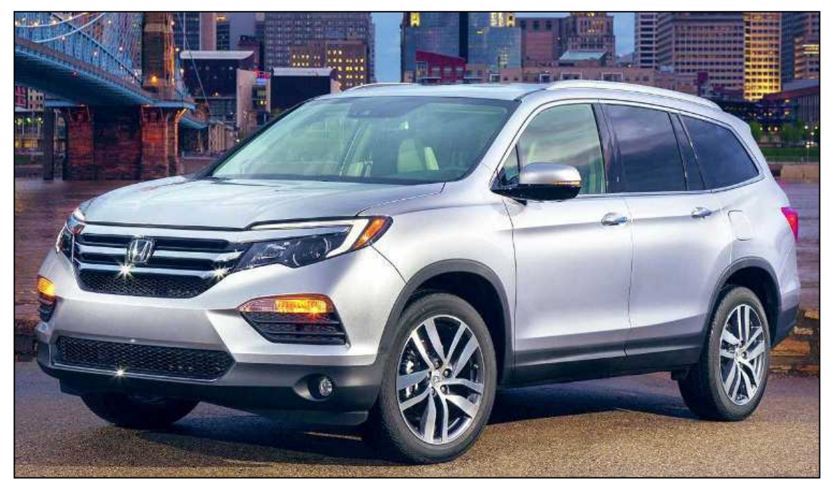
The Pilot, Honda's popular three-row SUV, gets a totally new design for the 2016 model year.

Since its arrival in 2003 as the first three-row, mainstream SUV to be developed on a car-like unit-body platform, the Pilot has helped set industry standards for fuel efficiency, spacious and thoughtful interior packag-