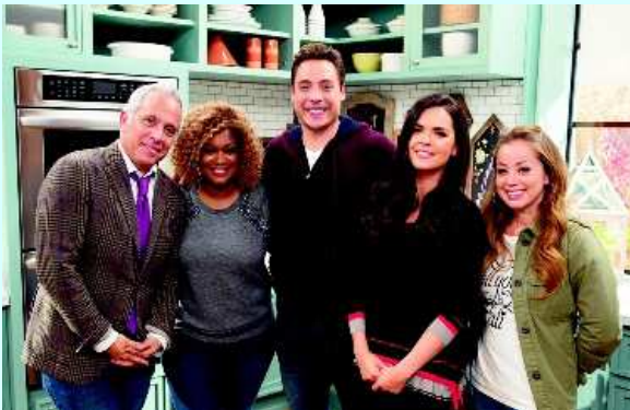
Geoffrey Zakarian, Sunny Anderson, Jeff Mauro, Katie Lee and Marcela Valladolid as seen in "The Kitchen"

"The Kitchen" is currently in its 12th season, and if there's one thing that's helped it stand out in a crowded talk show landscape, it's the warmth and chemistry between its hosts. Geoffrey, Katie, Sunny, Jeff and Marcela are all cheesing it up in the kitchen Saturday, March 25, on Food Network.