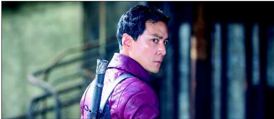
Daniel Wu stars in "Into the Badlands"

One of the most dangerous clippers in the Badlands, Sunny has worked his way up through the ranks to become regent (head clipper) to the area's most powerful Baron, Quinn (Marton Csokas, "The Lord of the Rings: The Fellowship of the Ring," 2001). In the first season,