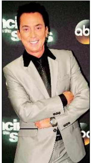
Bruno Tonioli from "Dancing With the Stars"