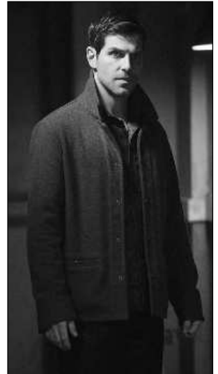
David Giuntoli stars in "Grimm"