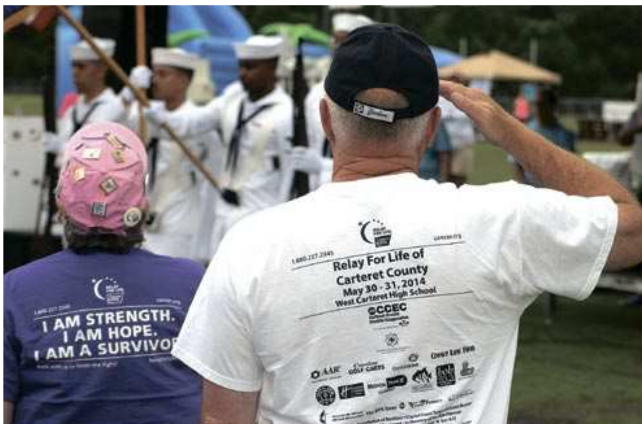
Participants stand at attention during the presentation of colors at the American Cancer Society Relay For Life, at a past Relay for Life event.