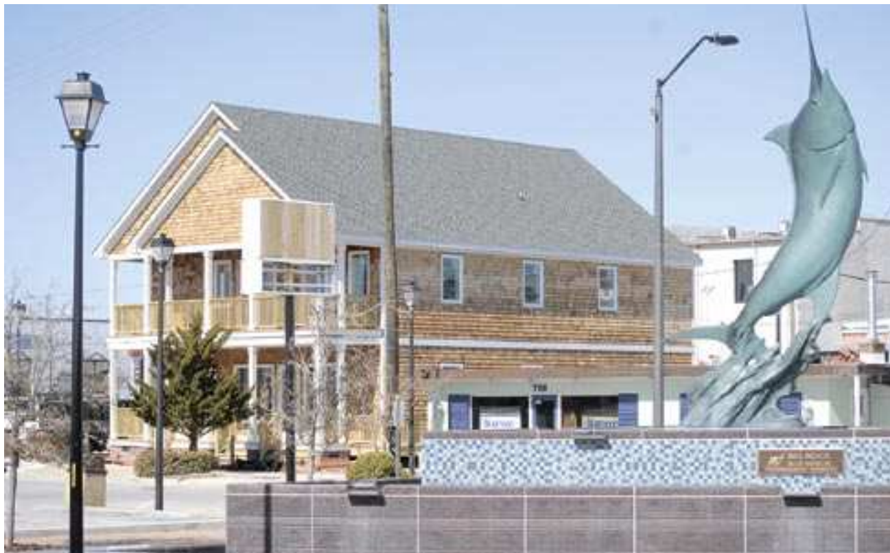
This summer Big Rock fans can join events hosted at its new headquarters, 710 Evans St., Morehead City, shown above.