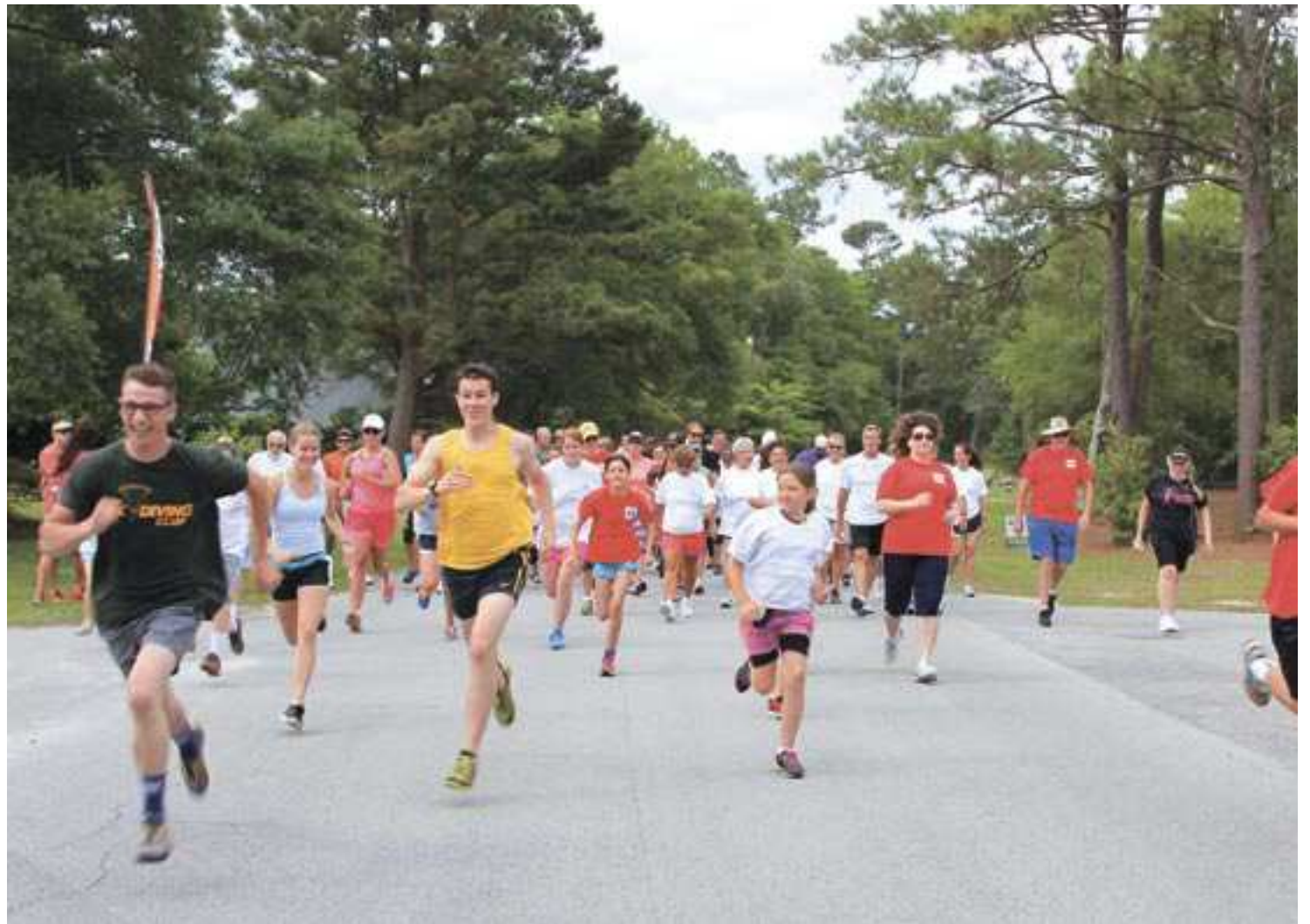
Runners participate in the first melanoma walk in 2014. This year’s walk will be held on Saturday, May 30.

“With much personal concern, I showed the mole to many loved ones,” she said. “My husband, my mom, my primary M.D. and my OB/GYN,” referring to her doctor and obstetrics and gynecology physician. “The pencil-sized mole continued to press on my mind.”