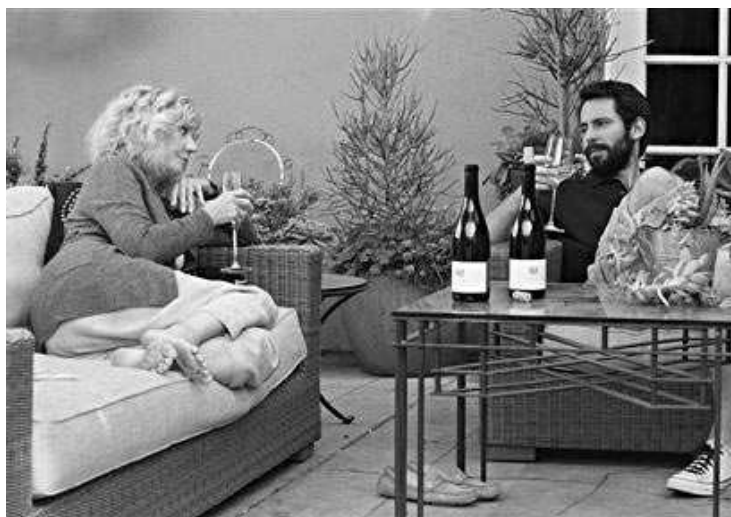
Bleecker Street via AP photo

snippets of it, but the highs and lows of filmed melodrama seldom truly reflect a condition that far too many people know all too well.