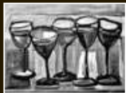
Put A Cork In It